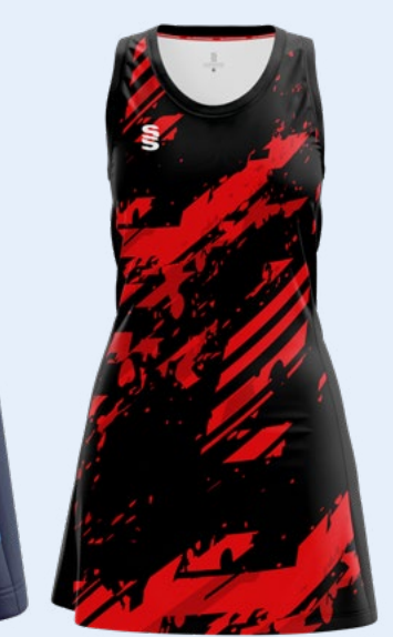
BESPOKE NETBALL DRESS DESIGN Crafted by Survidge AVAILABLE IN 11 MODERN COLOURS