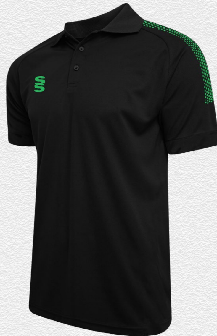
Dual Gym Shirt DU014