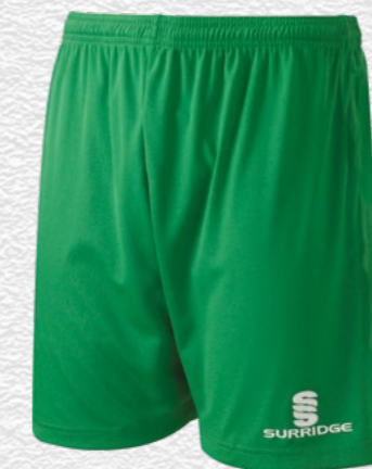
Surridge Match Short SURF005

Complete your bespoke football kit by adding Surridge Sports stock range of shorts and socks. See examples below: