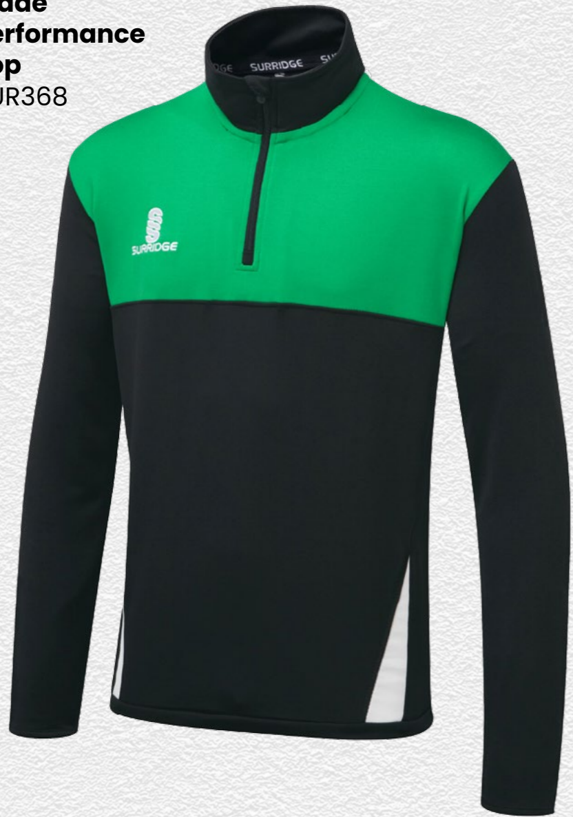
Blade Performance Top SUR368