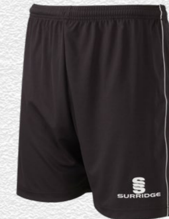
Classic Short SURF026