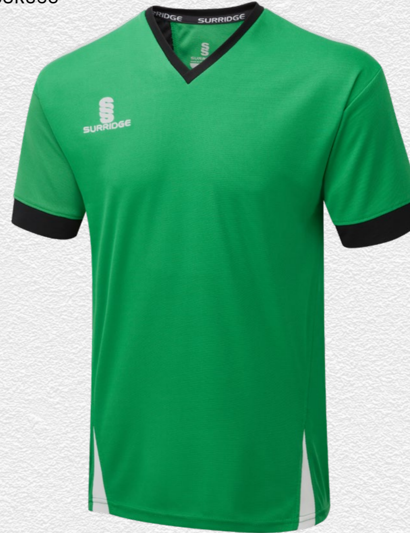
Blade Polo Shirt SUR366