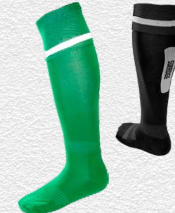
Surridge Single Band Sock SURF027

Also available: Surridge Womens Match Short SUB-C-SHORTS-W005. Please note: These are NOT part of the Surridge Stock Range.