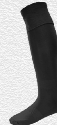
Surridge Match Sock SURF006