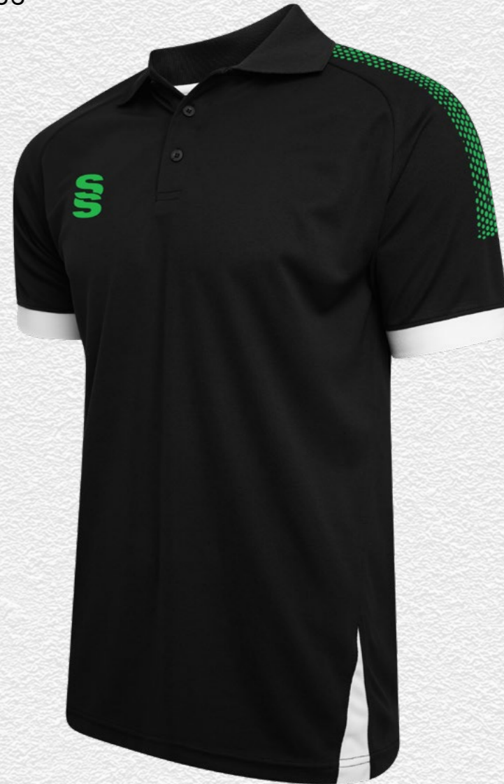
Fuse Polo Shirt DU366