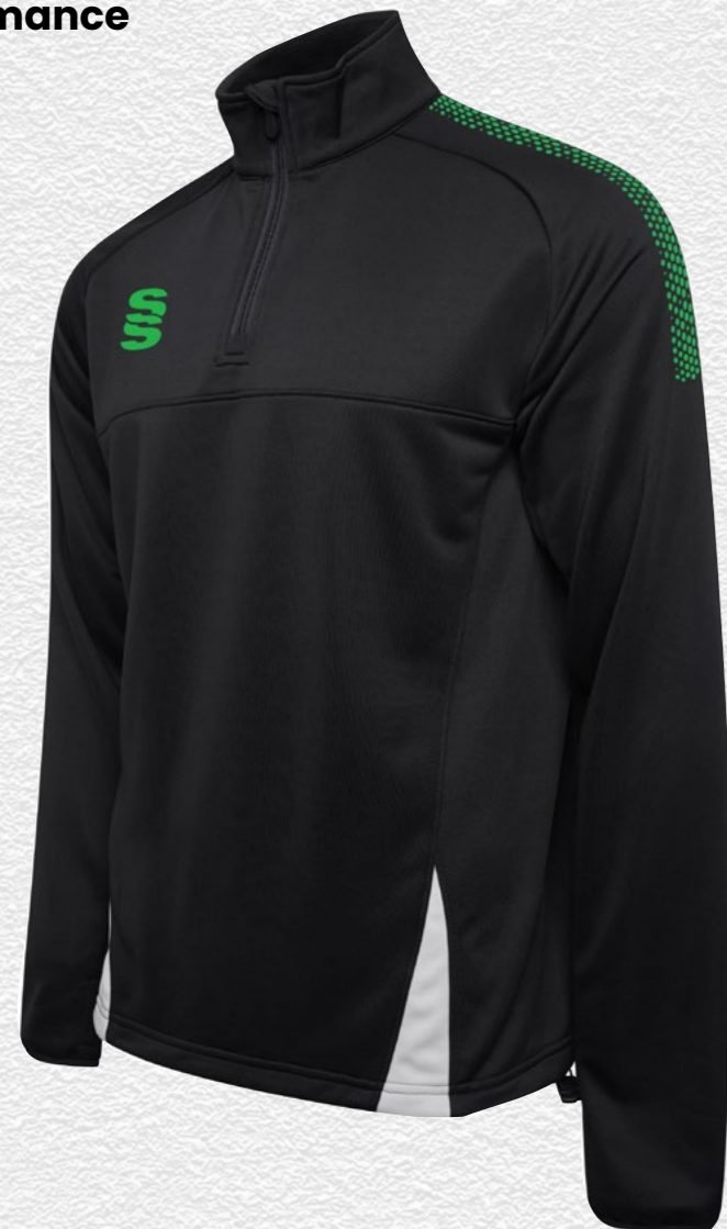
Fuse 1/4 Zip Performance Top DU368