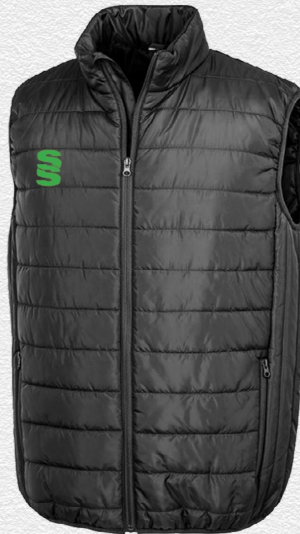
Holkham Down Feel Jacket SUR181