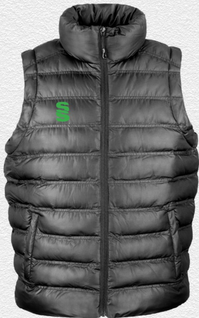
Ice Bird Padded Gilet SUR193