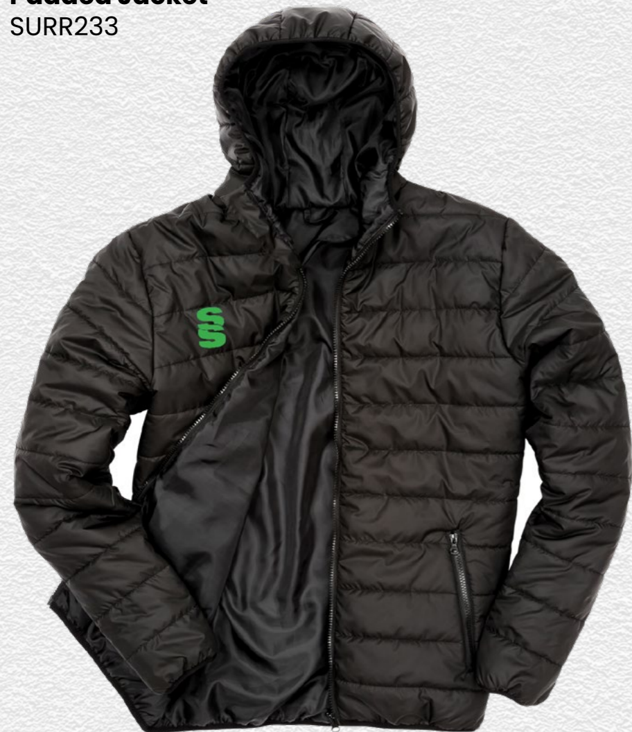
Supersoft Padded Jacket SURR233