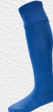
Surridge Match Sock SURF006