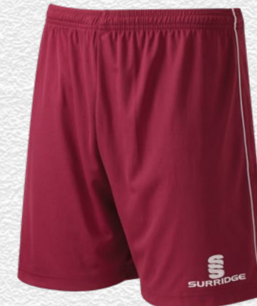
Classic Short SURF026