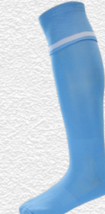
Surridge Single Band Sock SURF027