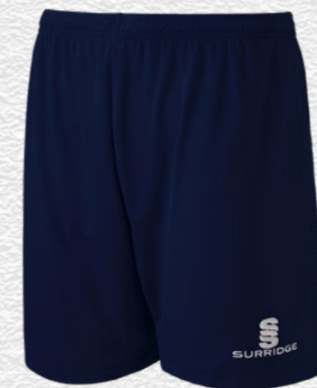
Surridge Match Short SURF005

Complete your bespoke football kit by adding Surridge Sports stock range of shorts and socks. See examples below: