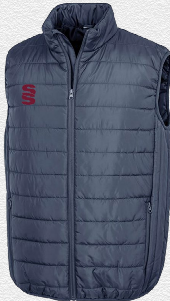
Holkham Down Feel Jacket SUR181