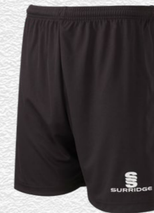
Surridge Match Short SURF005

Complete your bespoke football kit by adding Surridge Sports stock range of shorts and socks. See examples below: