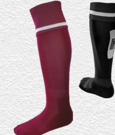
Surridge Single Band Sock SURF027

Also available: Surridge Womens Match Short SUB-C-SHORTS-W005. Please note: These are NOT part of the Surridge Stock Range.