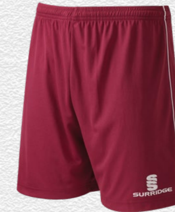
Classic Short SURF026