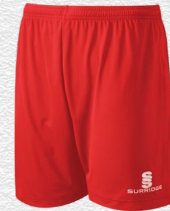
Surridge Match Short SURF005

Complete your bespoke football kit by adding Surridge Sports stock range of shorts and socks. See examples below: