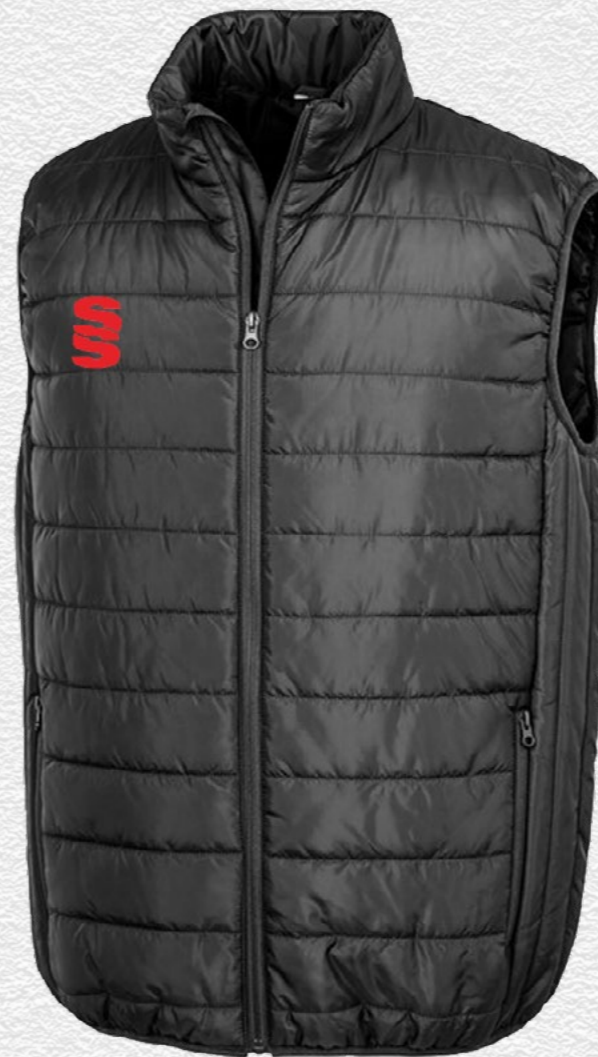
Holkham Down Feel Jacket SUR181