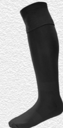
Surridge Match Sock SURF006