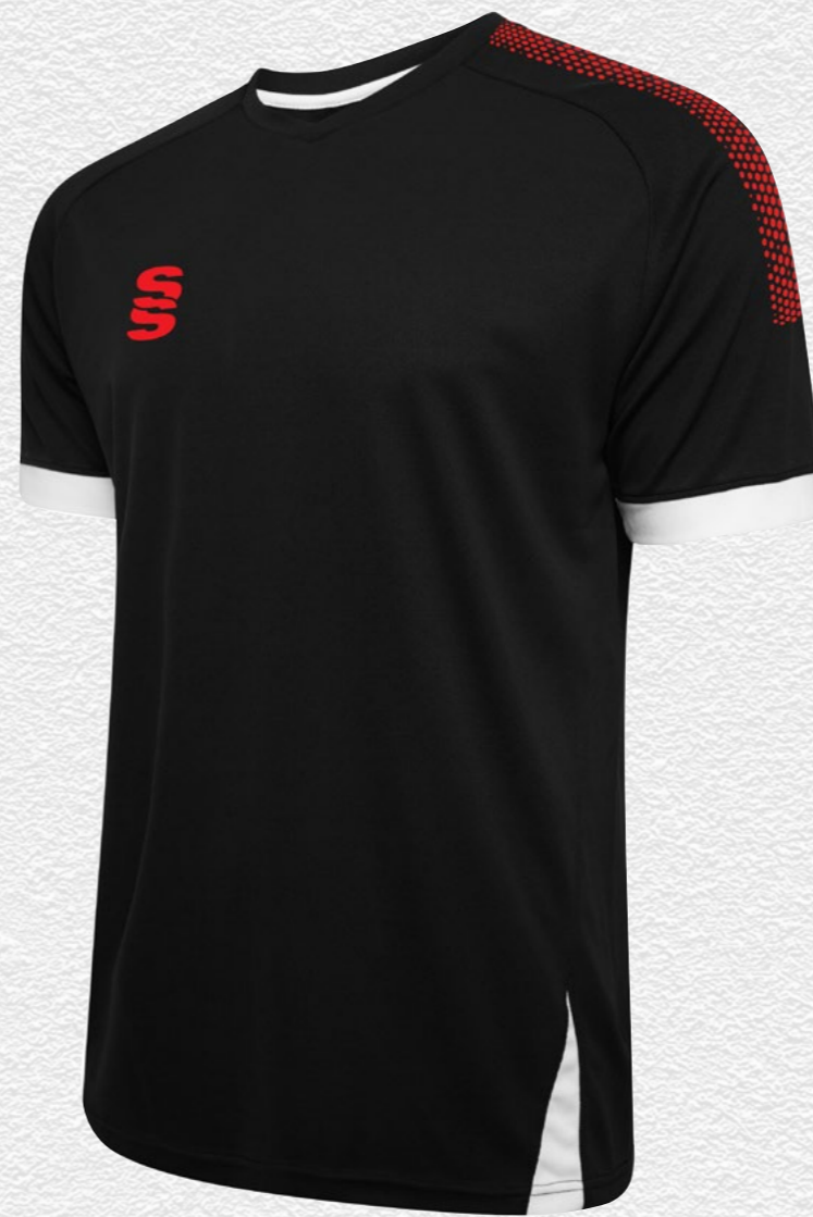
Fuse Polo Shirt DU366