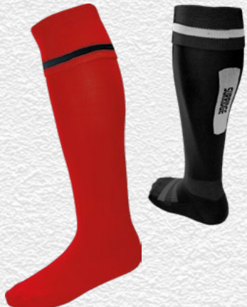
Surridge Single Band Sock SURF027

Also available: Surridge Womens Match Short SUB-C-SHORTS-W005. Please note: These are NOT part of the Surridge Stock Range.