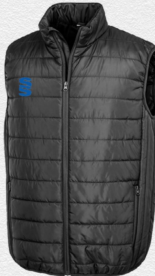
Holkham Down Feel Jacket SUR181