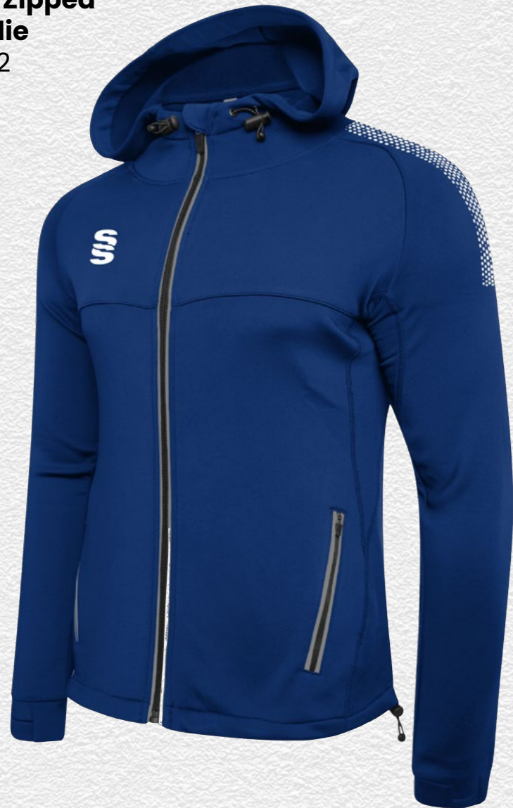
Dual Rain Jacket DU003