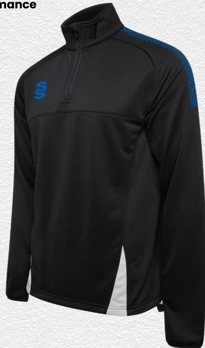
Fuse 1/4 Zip Performance Top DU368