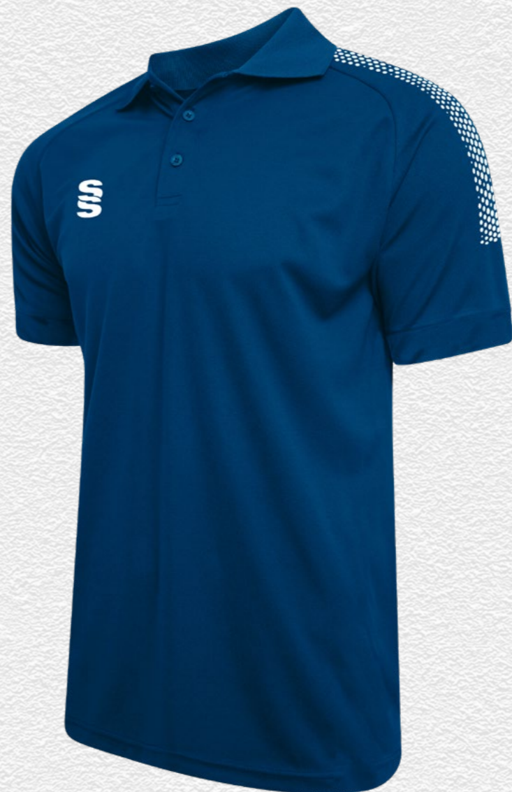
Dual Gym Shirt DU014