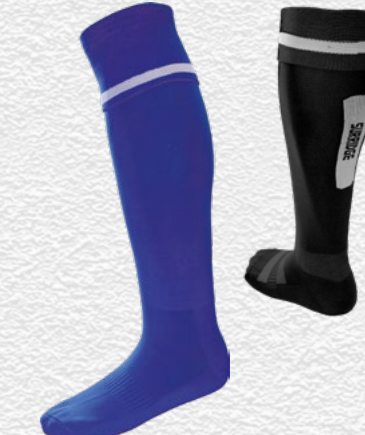
Surridge Single Band Sock SURF027

Also available: Surridge Womens Match Short SUB-C-SHORTS-W005. Please note: These are NOT part of the Surridge Stock Range.