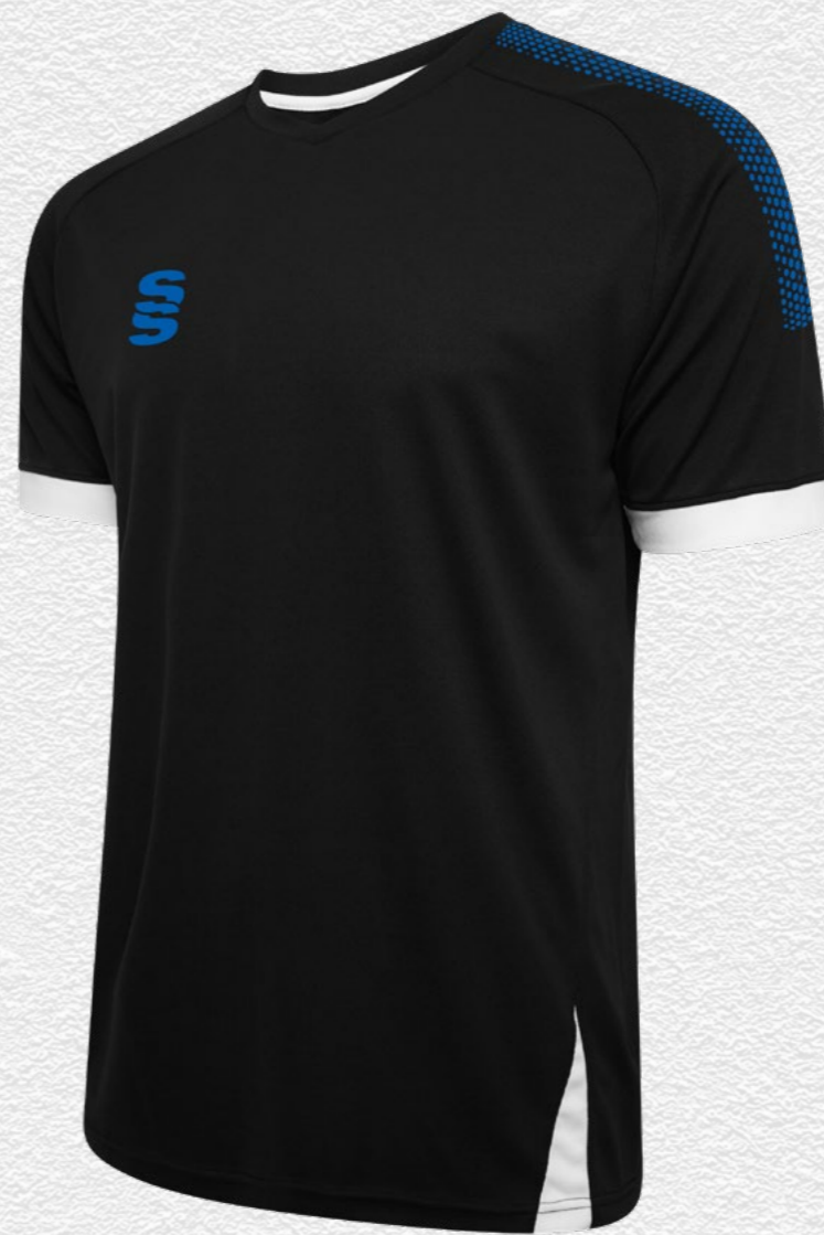
Fuse Polo Shirt DU366