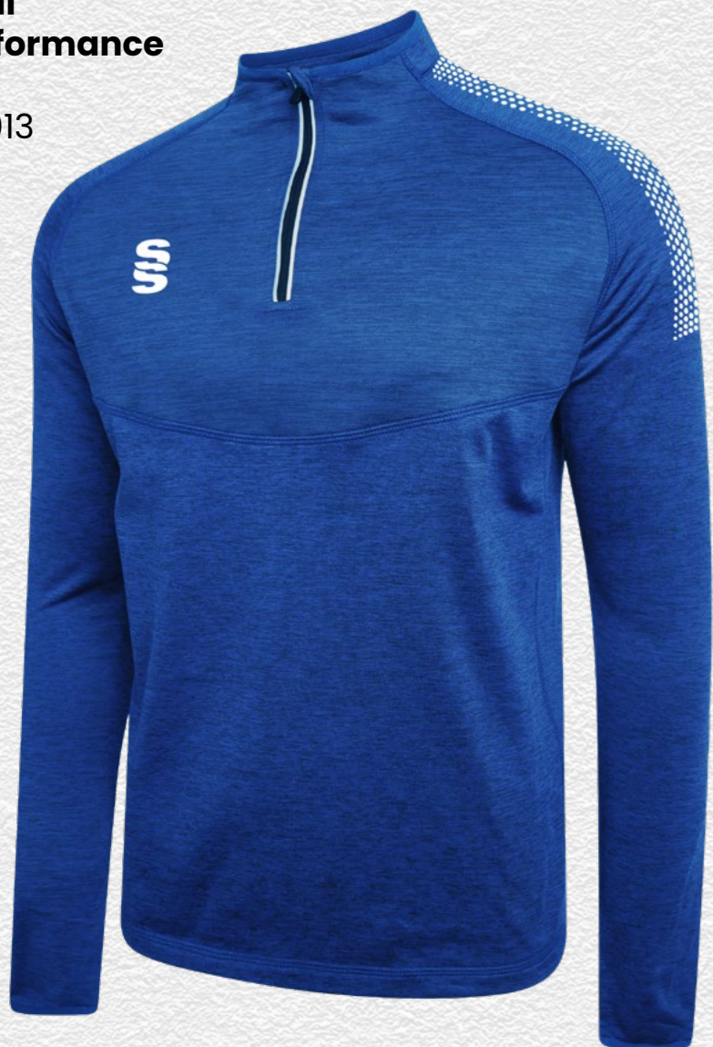
Dual Performance Top DU013