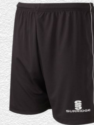
Classic Short SURF026