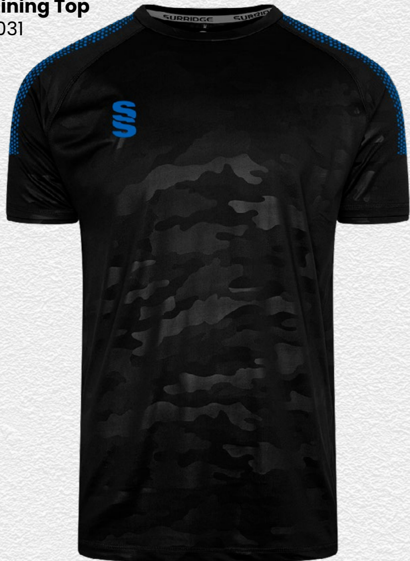
Camo Training Top DU031