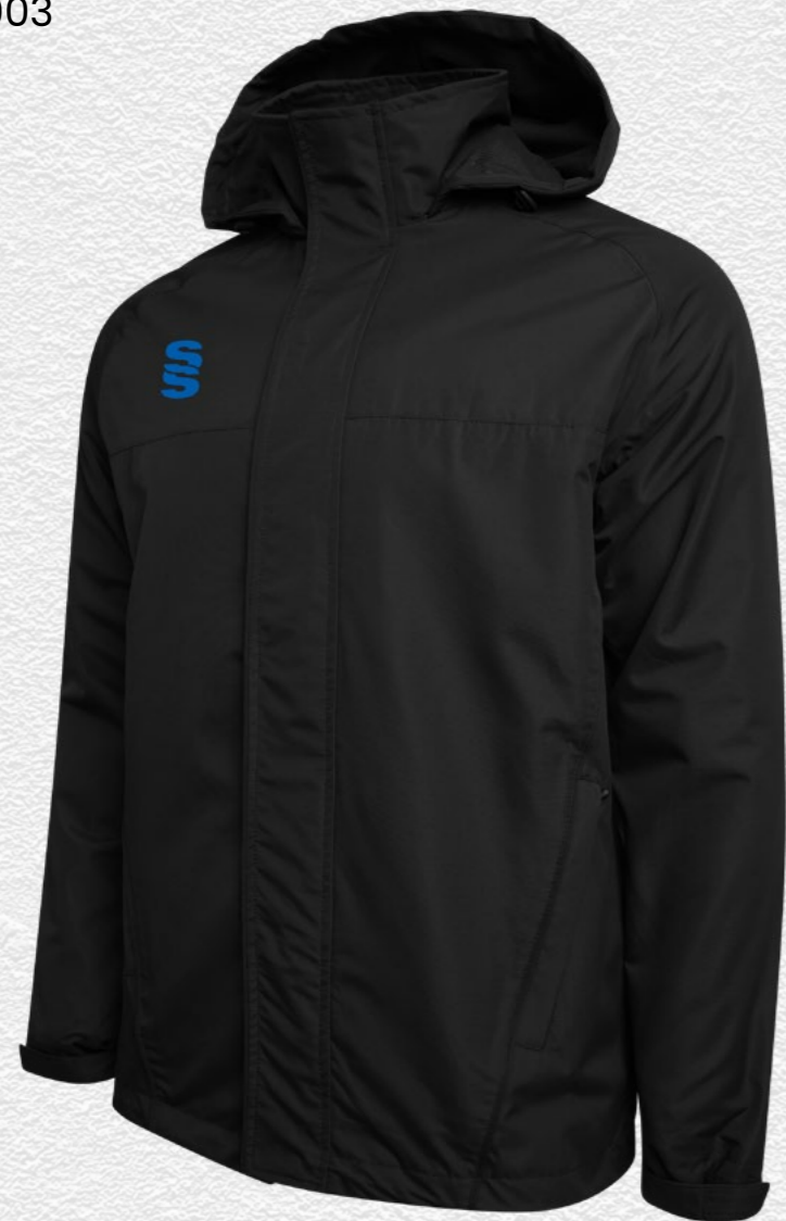
Dual Rain Jacket DU003