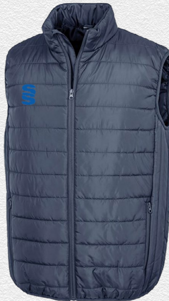
Holkham Down Feel Jacket SUR181