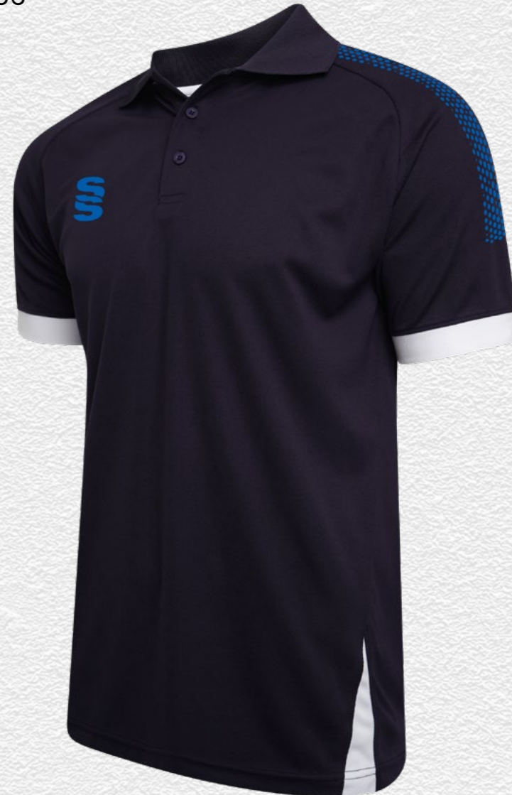
Fuse Polo Shirt DU366