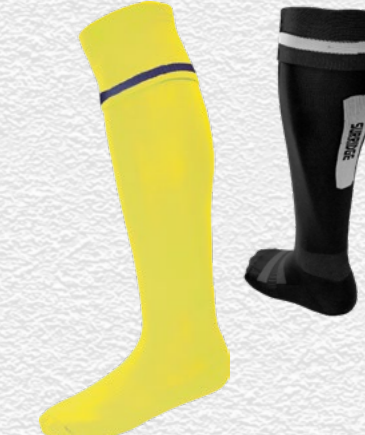
Surrige Single Band Sock SURF027

Also available: Surrige Womens Match Short SUB-C-SHORTS-W005. Please note: These are NOT part of the Surridge Stock Range.