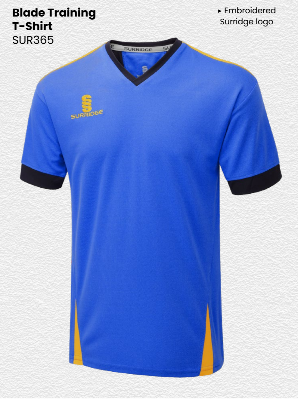
Blade Training T-Shirt SUR365