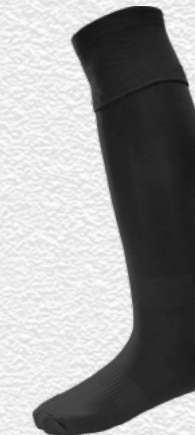
Surrige Match Sock SURF006