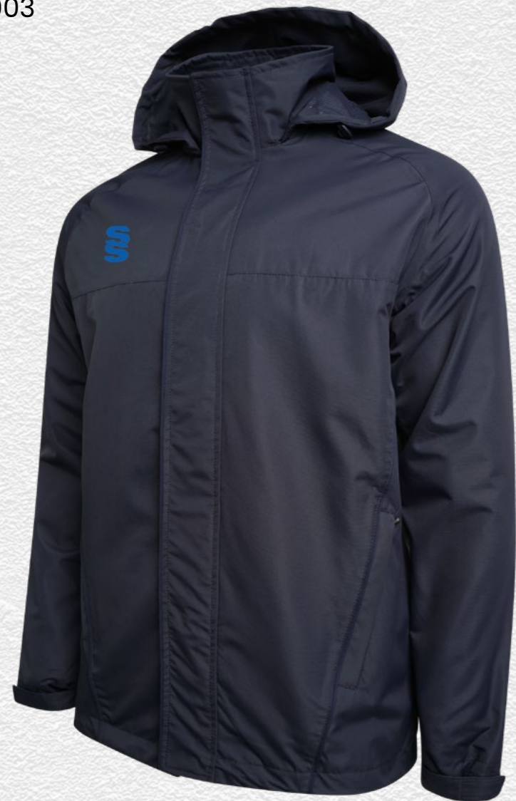
Dual Rain Jacket DU003