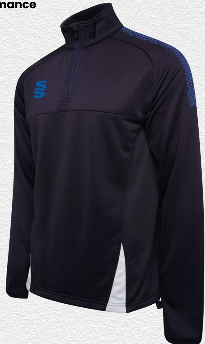
Fuse 1/4 Zip Performance Top DU368