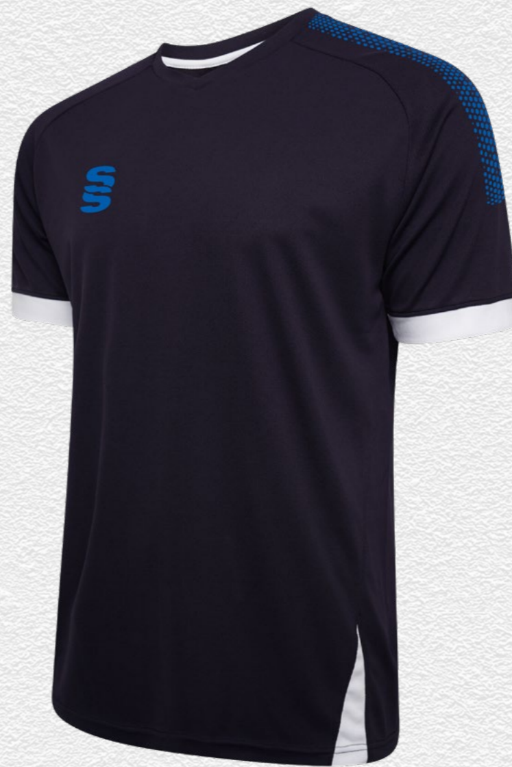
Fuse T-Shirt DU365