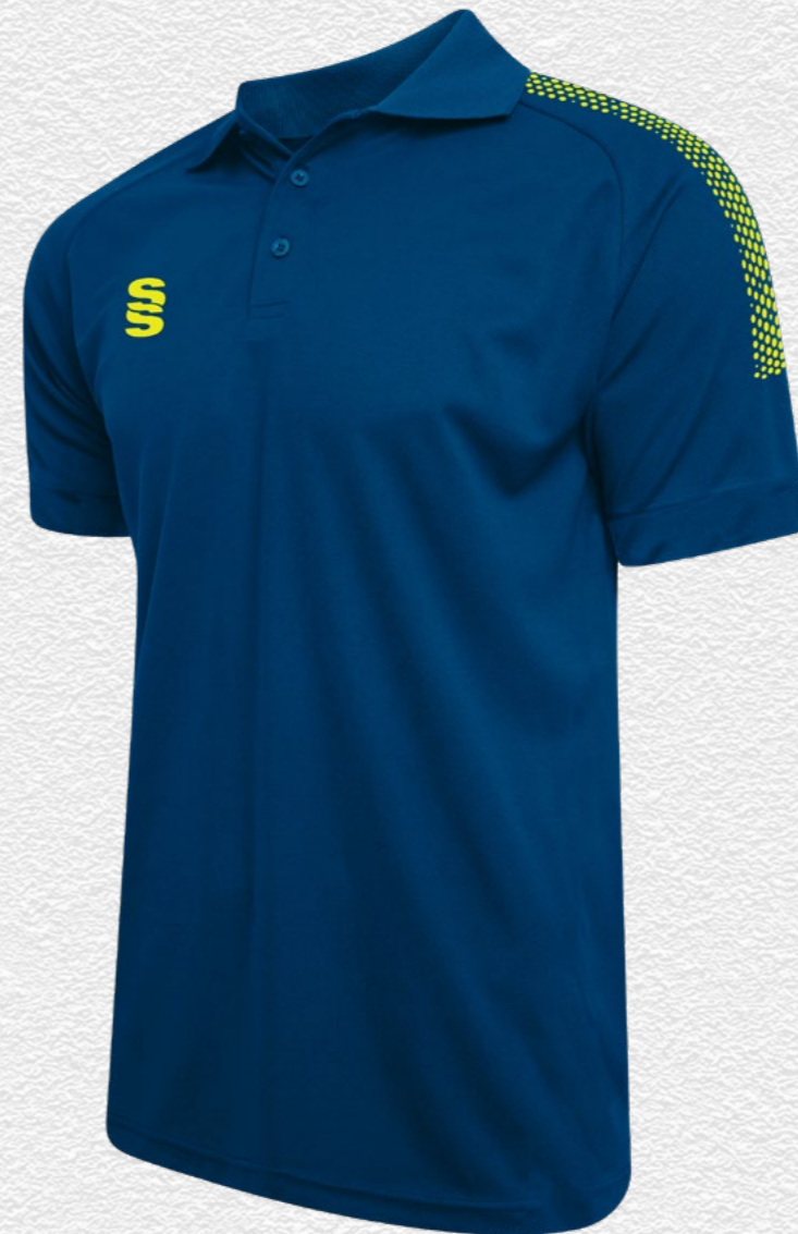
Dual Gym Shirt DU014