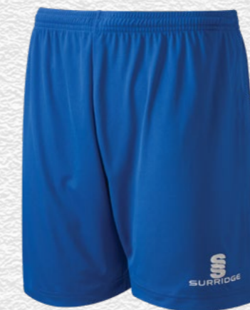
Surrige Match Short SURF005

Complete your bespoke football kit by adding Surridge Sports stock range of shorts and socks. See examples below: