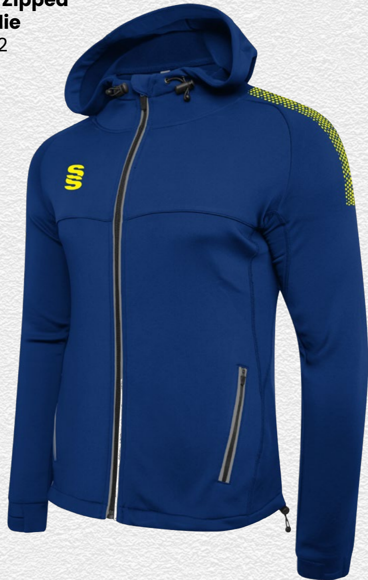
Dual Zipped Hoodie DU012