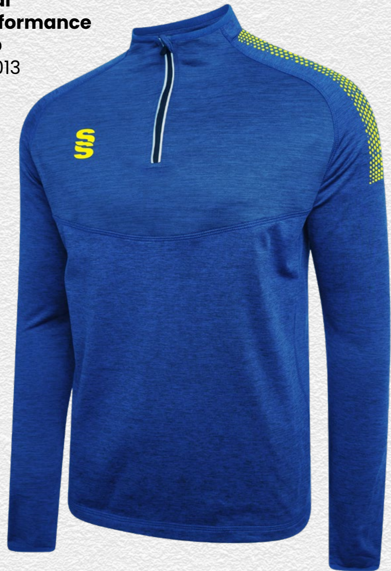
Dual Performance Top DU013