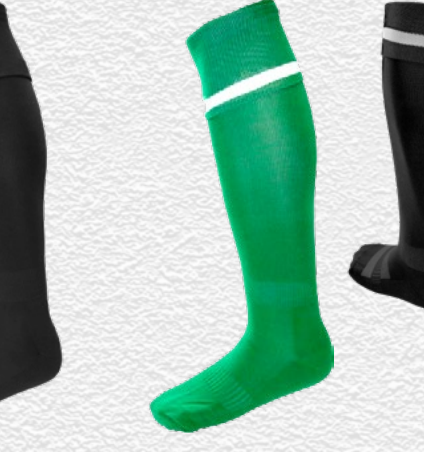
Surridge Single Band Sock SURF027

Also available: Surridge Womens Match Short SUB-C-SHORTS-W005.