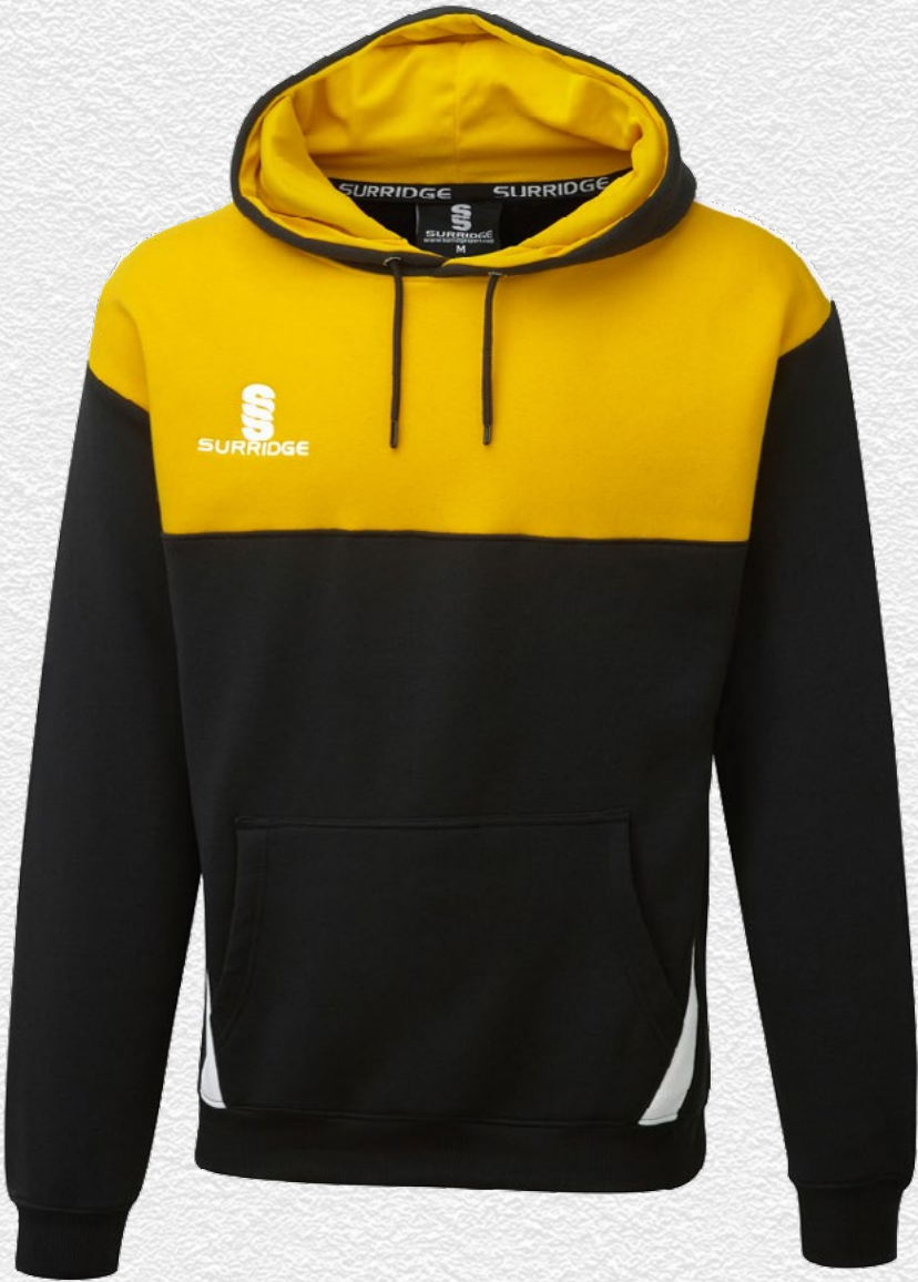
Blade Hoody SUR367