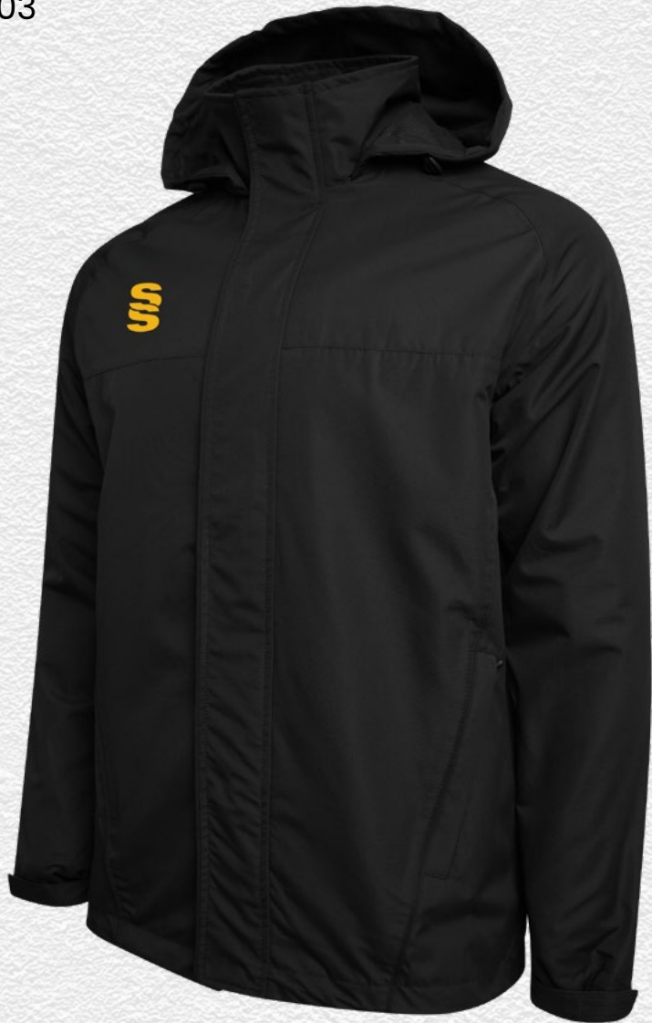
Dual Rain Jacket DU003