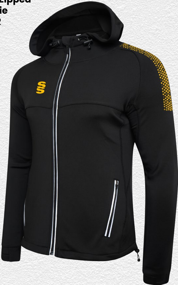
Dual Rain Jacket DU003