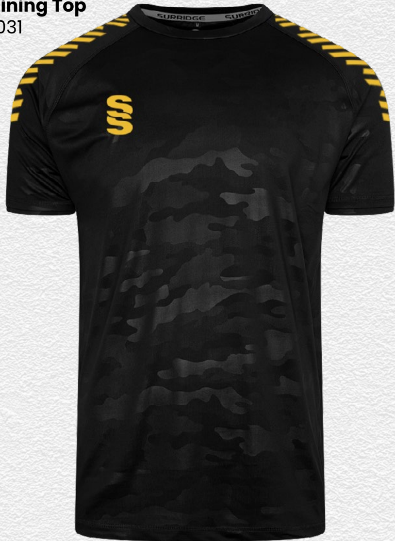
Camo Training Top DU031