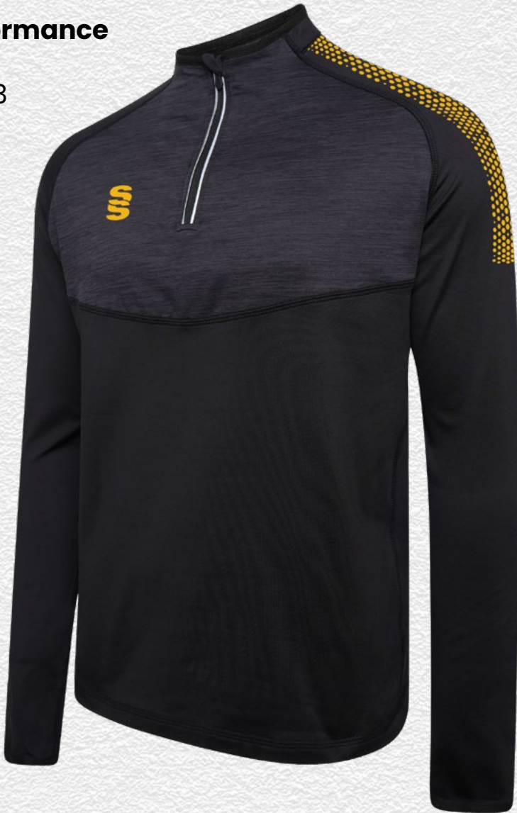
Dual Performance Top DU013