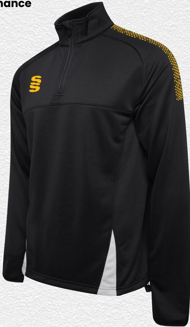
Fuse 1/4 Zip Performance Top DU368