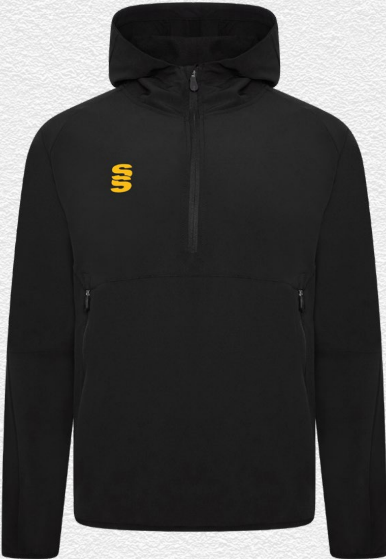
Holkham Down Feel Jacket SUR181