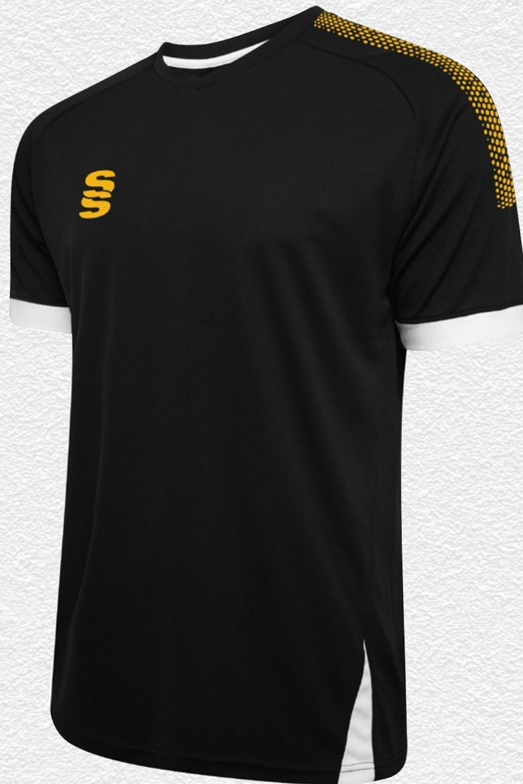
Fuse Polo Shirt DU366