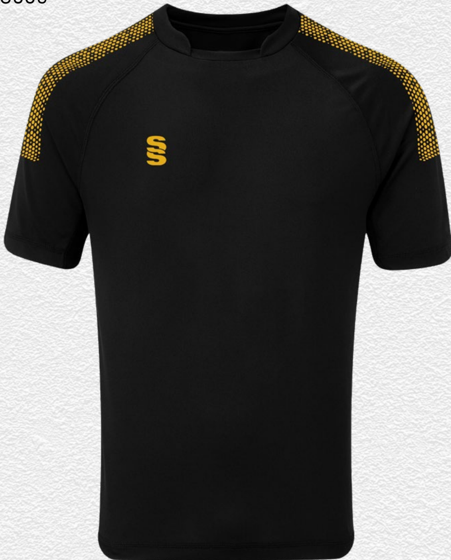
Dual Training Shirt DU009

► Printed SS/Dual Print ► Ladies have small Cap Sleeve