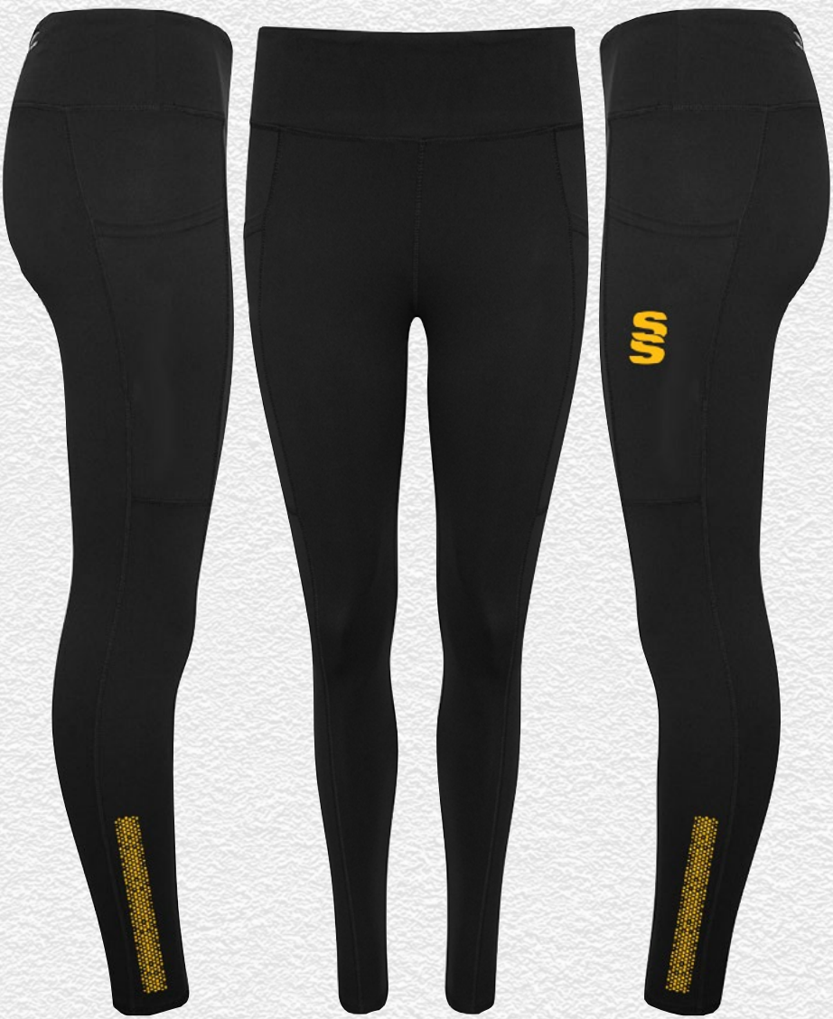
Performance Legging DU028