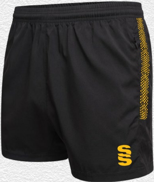
Dual Active Short DU029