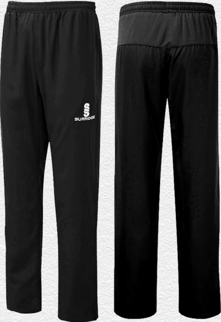
Poplin Pant SUR381