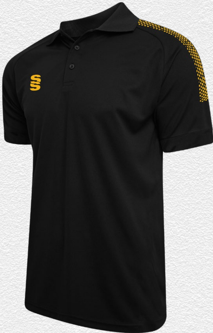
Dual Polo DU018