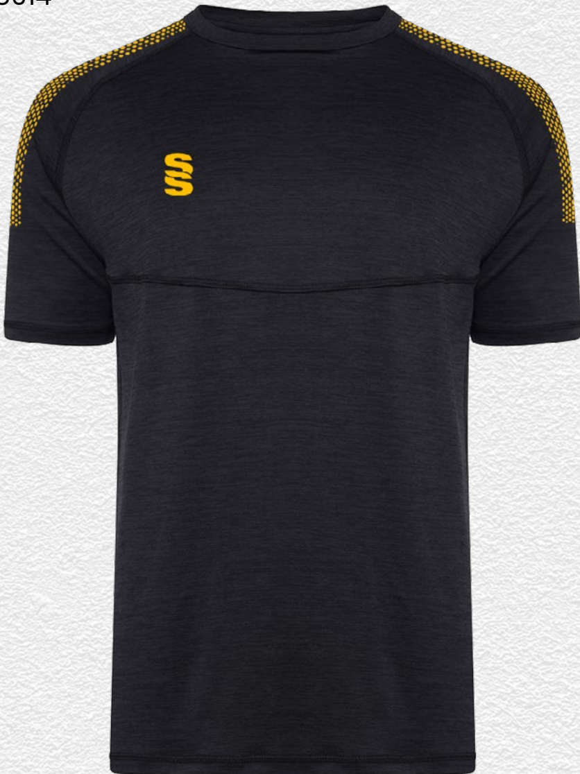
Dual Gym Shirt DU014