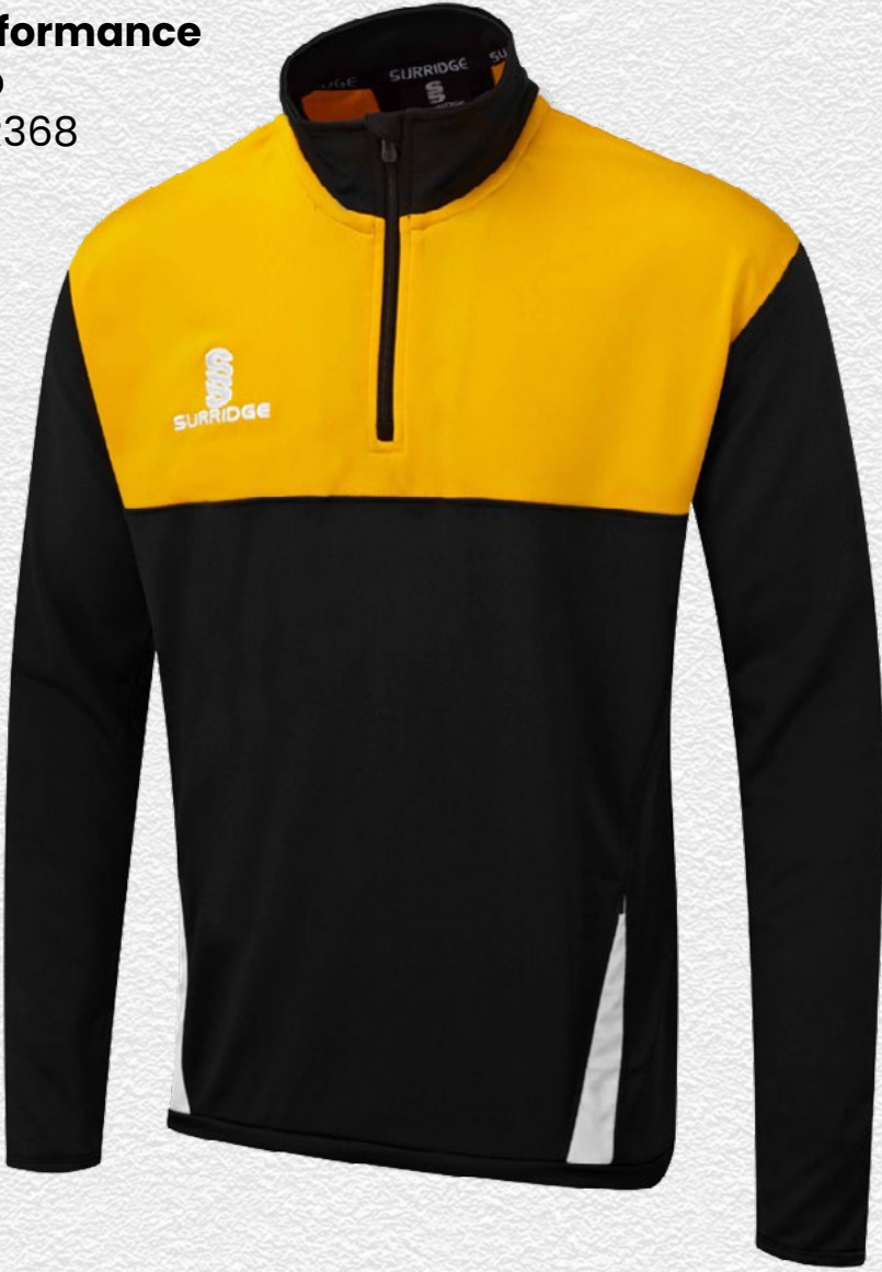
Blade Performance Top SUR368