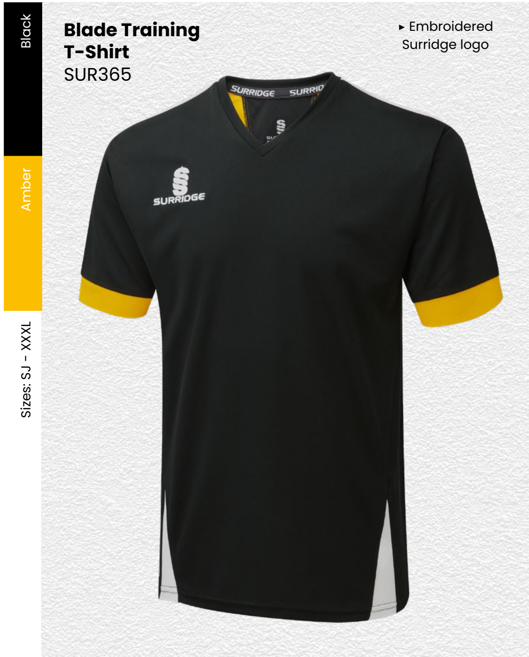
Blade Training T-Shirt SUR365