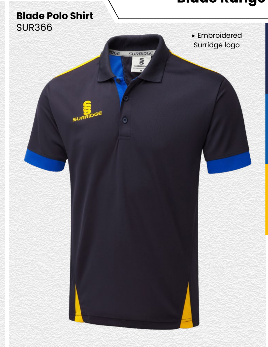
Blade Polo Shirt SUR366