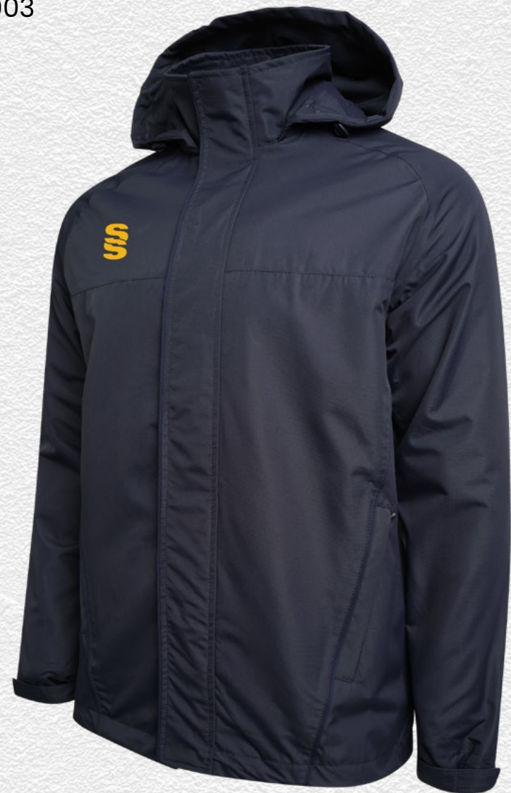
Dual Rain Jacket DU003