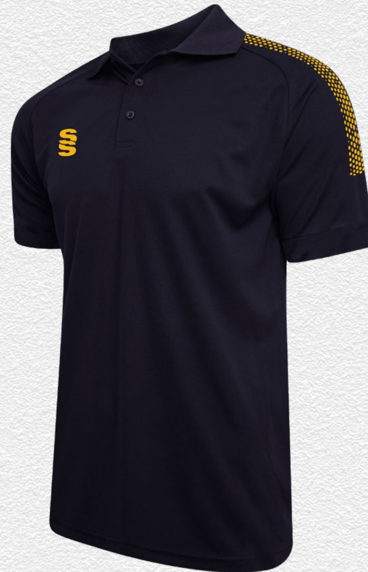
Dual Gym Shirt DU014