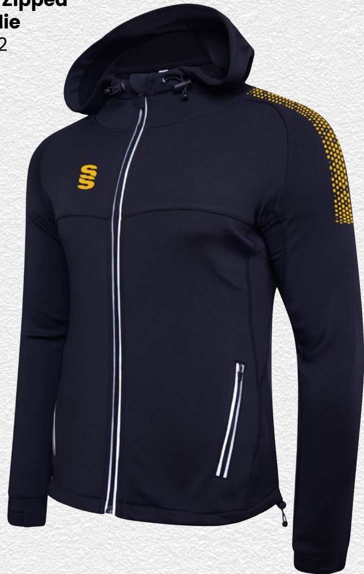
Dual Zipped Hoodie DU012