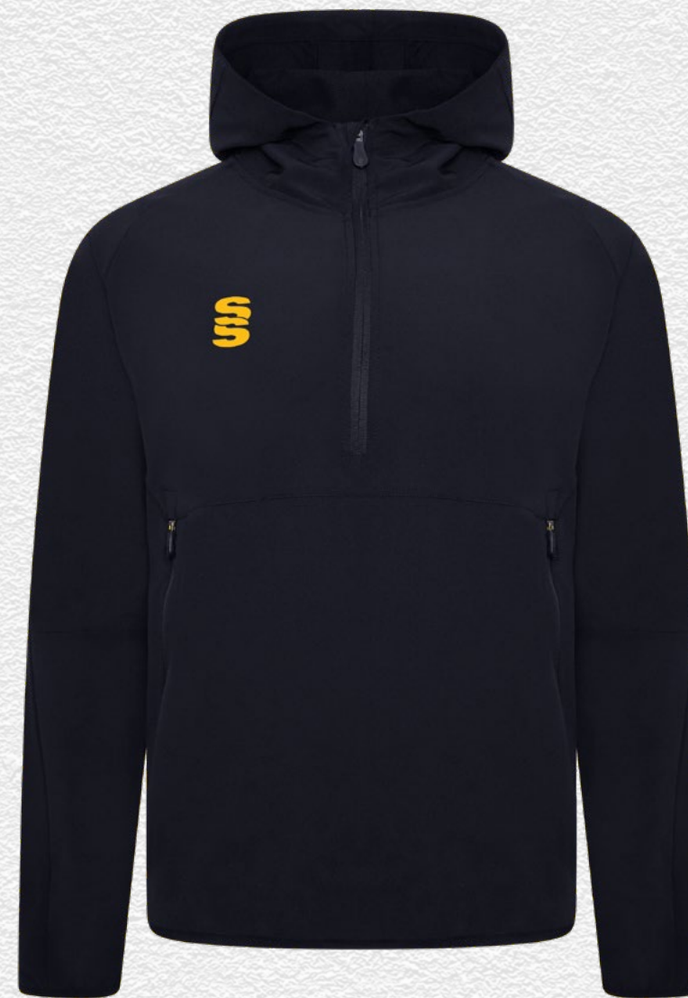
Holkham Down Feel Jacket SUR181