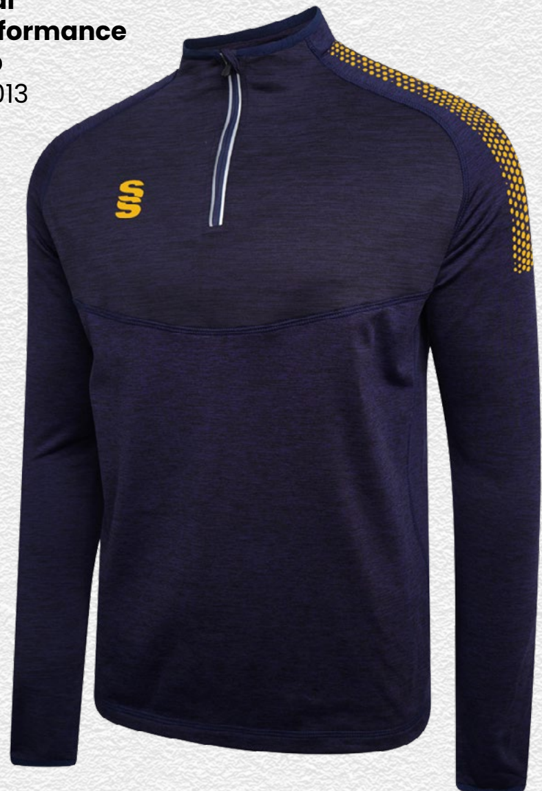
Dual Performance Top DU013