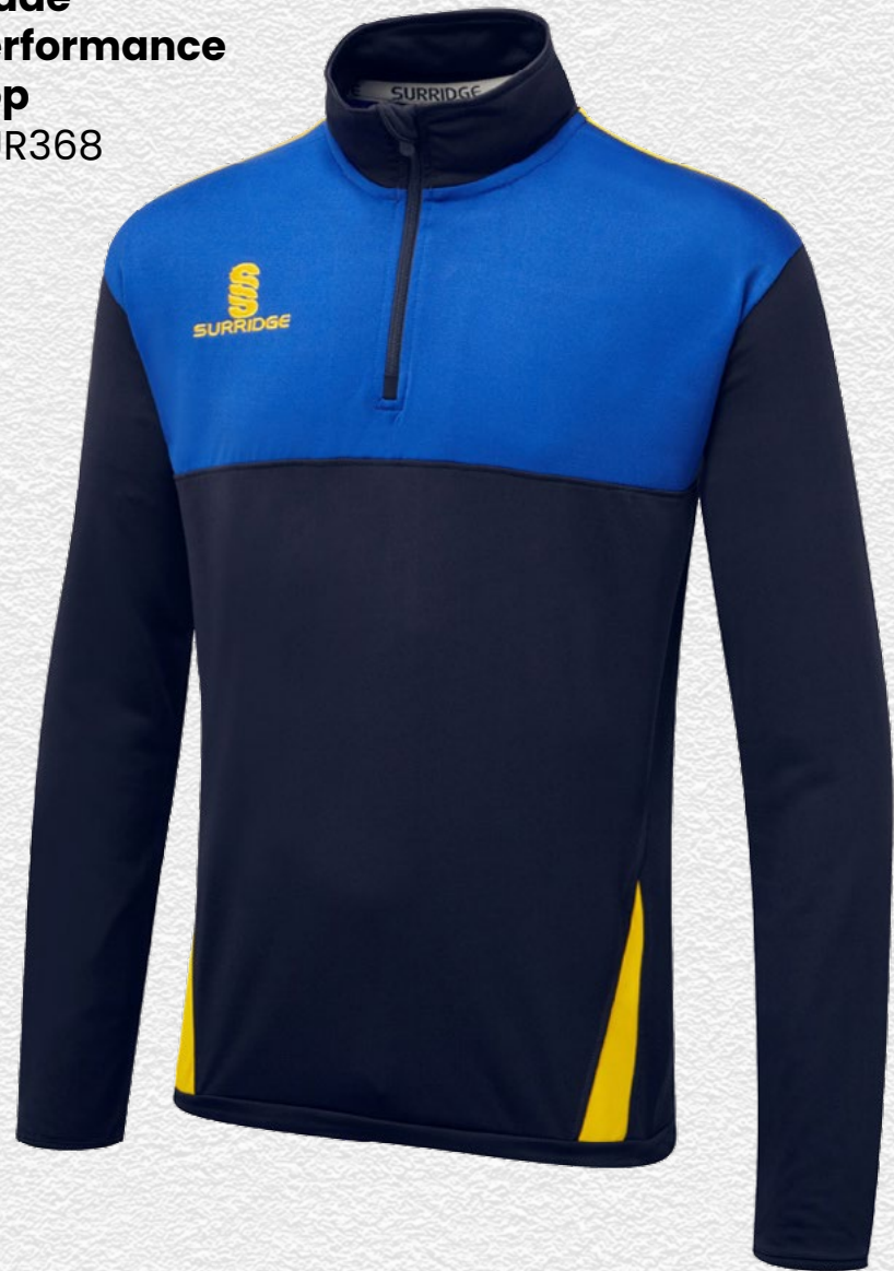
Blade Performance Top SUR368