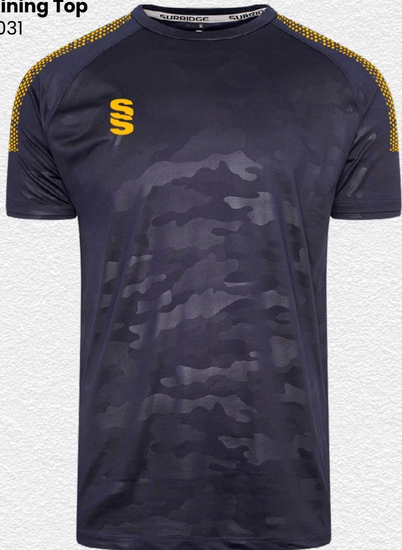
Camo Training Top DU031