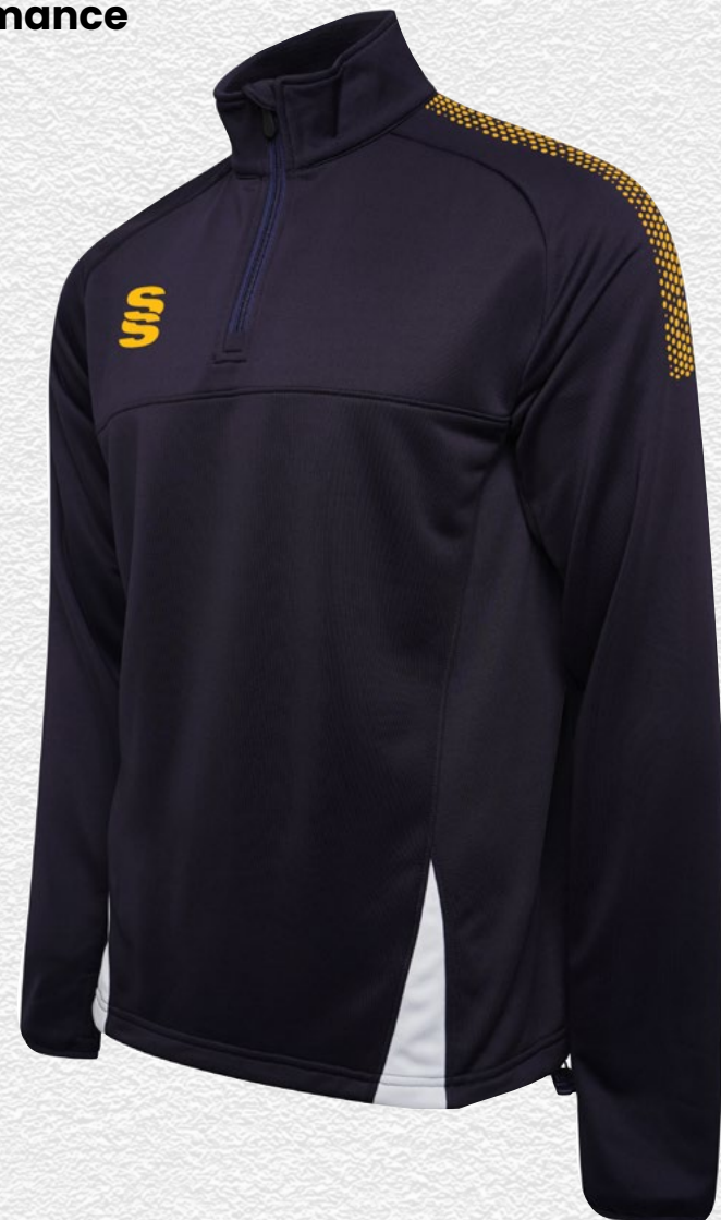
Fuse 1/4 Zip Performance Top DU368