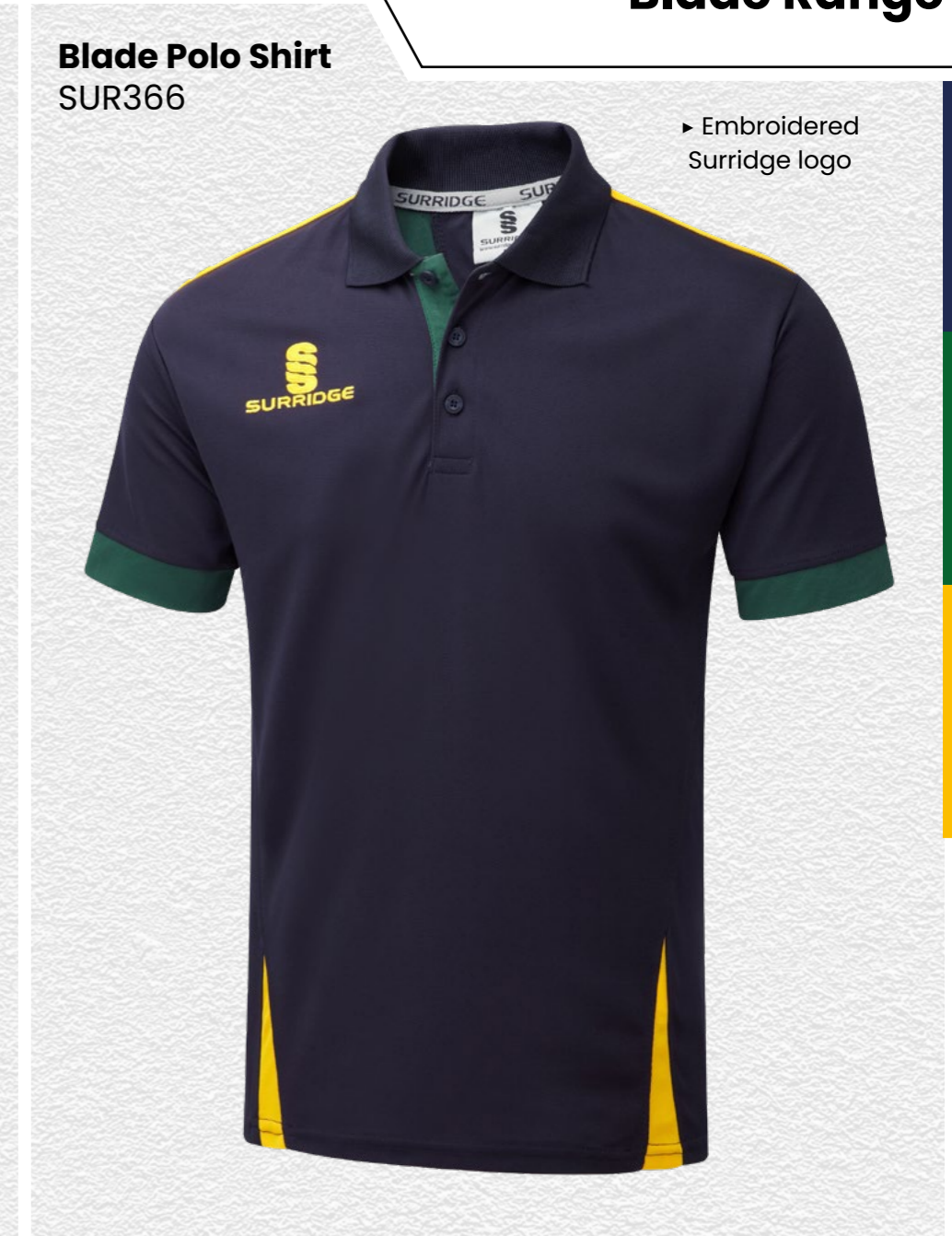
Blade Polo Shirt SUR366