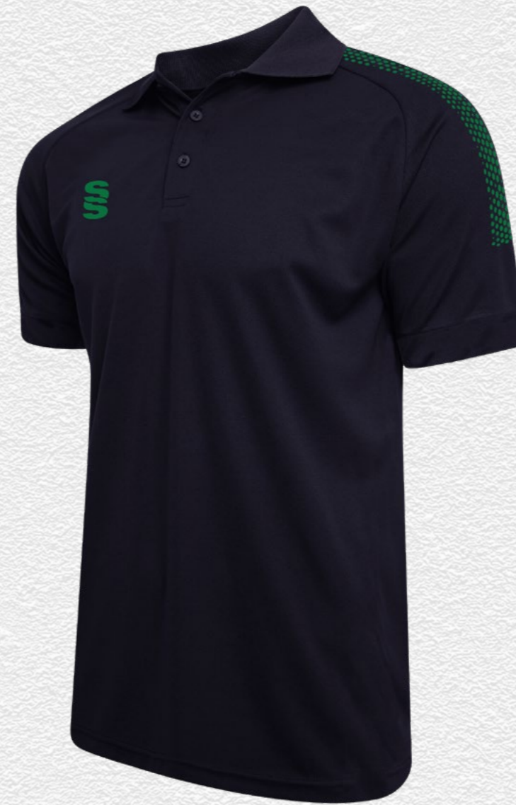
Dual Gym Shirt DU014