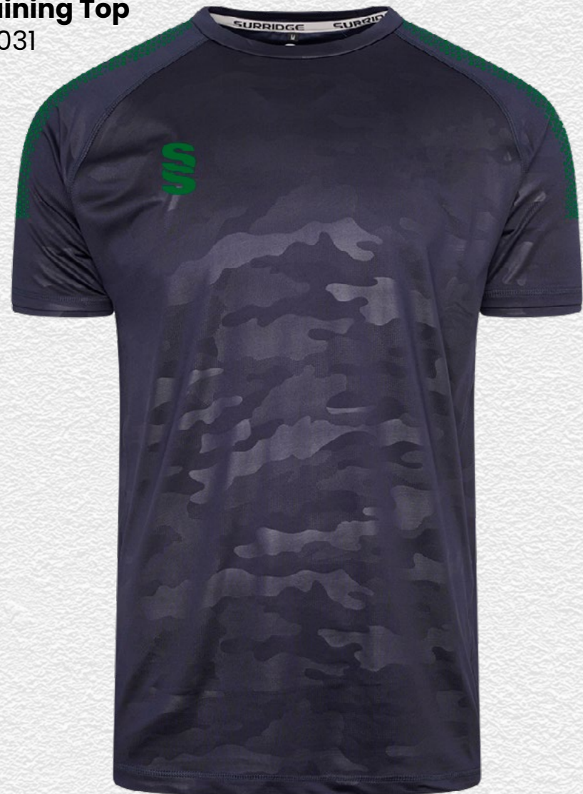
Camo Training Top DU031