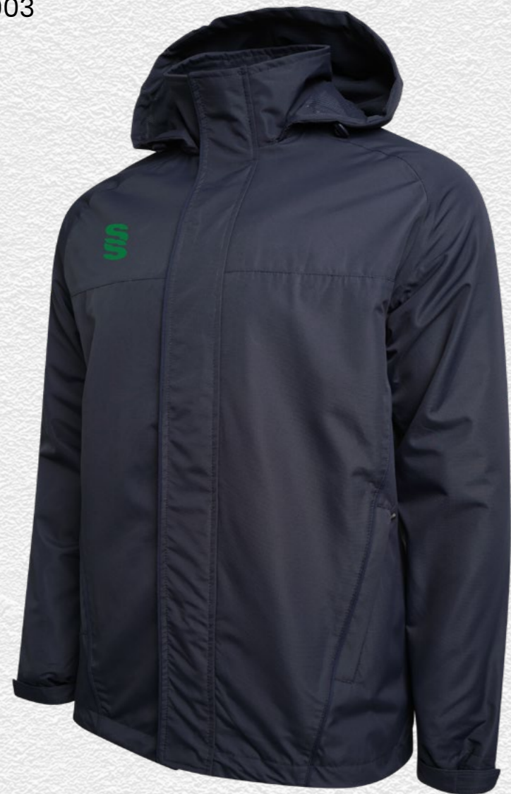
Dual Rain Jacket DU003