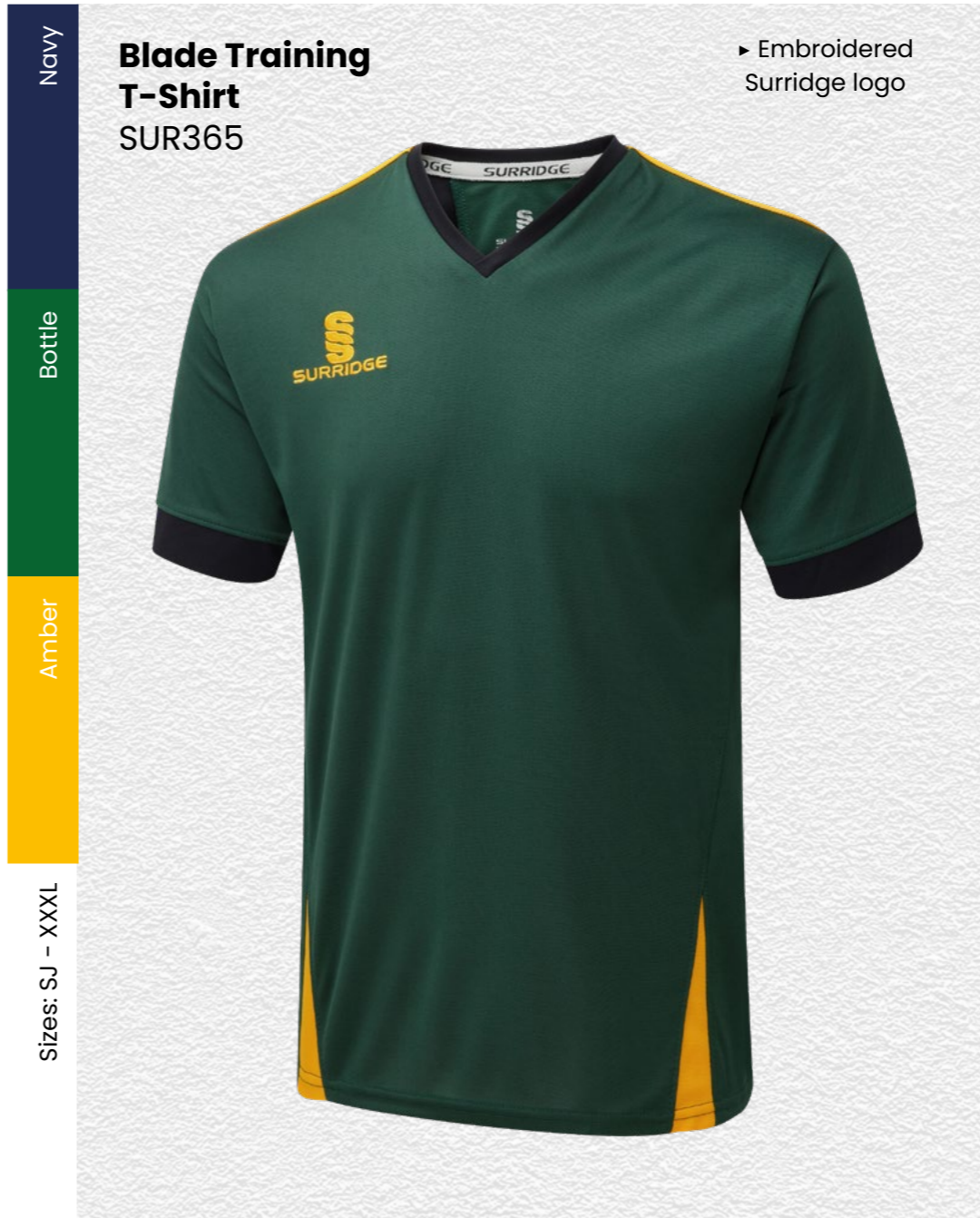
Blade Training T-Shirt SUR365