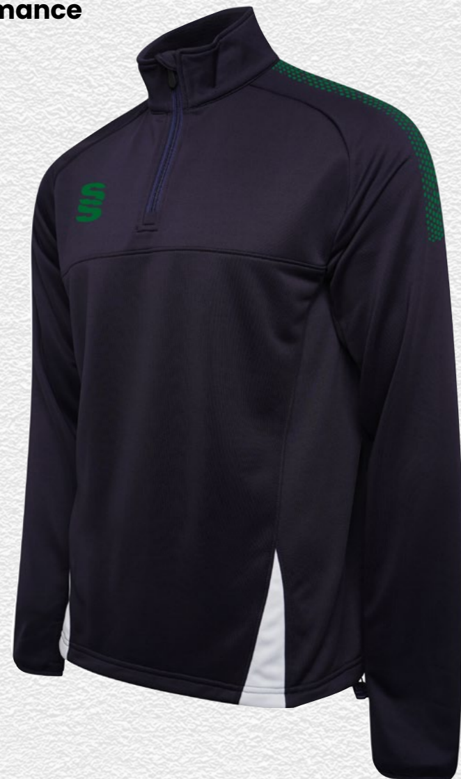
Fuse 1/4 Zip Performance Top DU368