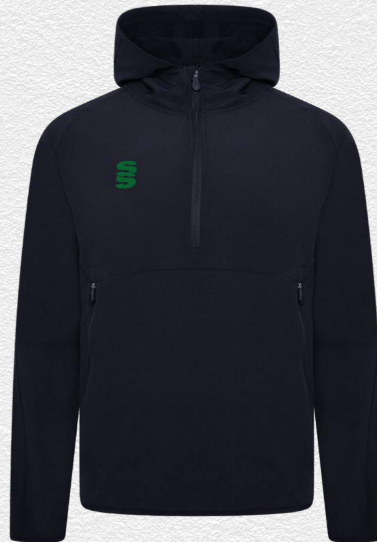
Holkham Down Feel Jacket SUR181