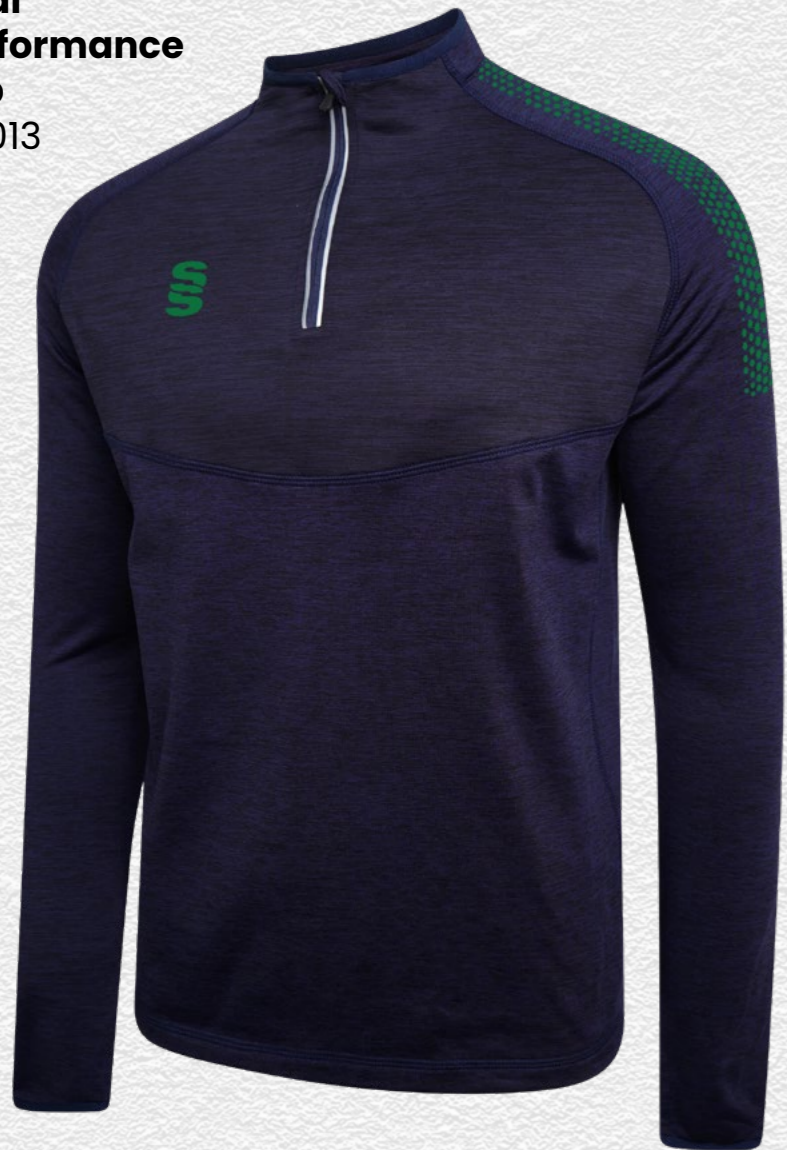
Dual Performance Top DU013