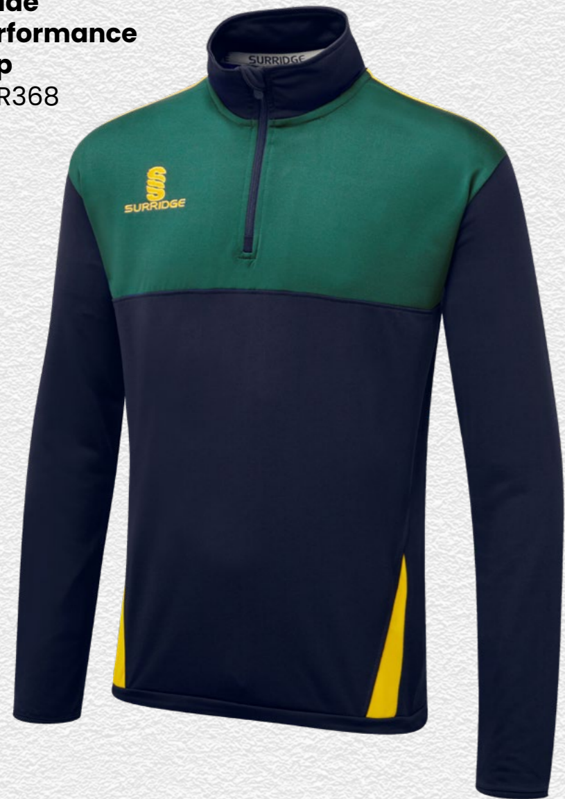
Blade Performance Top SUR368