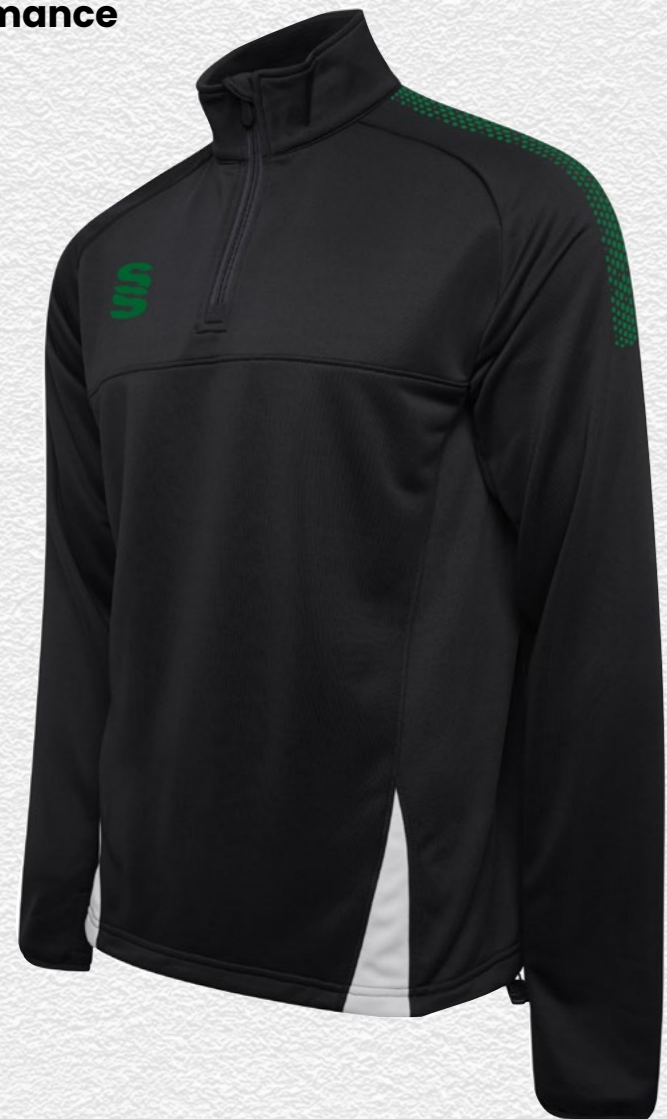
Fuse 1/4 Zip Performance Top DU368