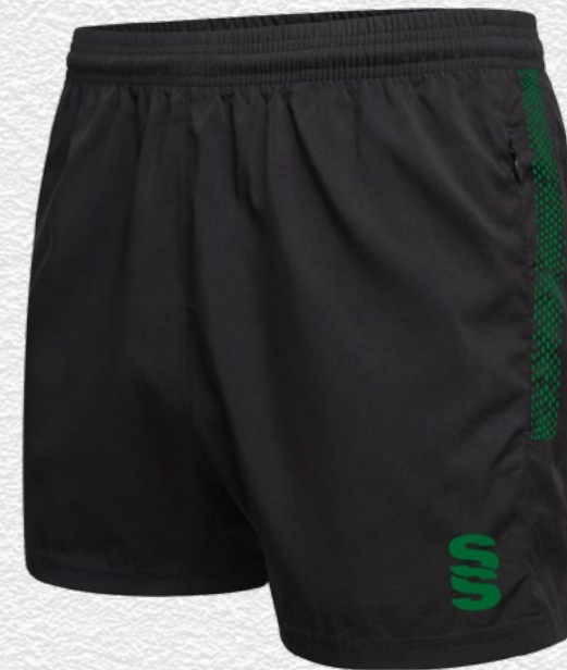
Dual Short DU020