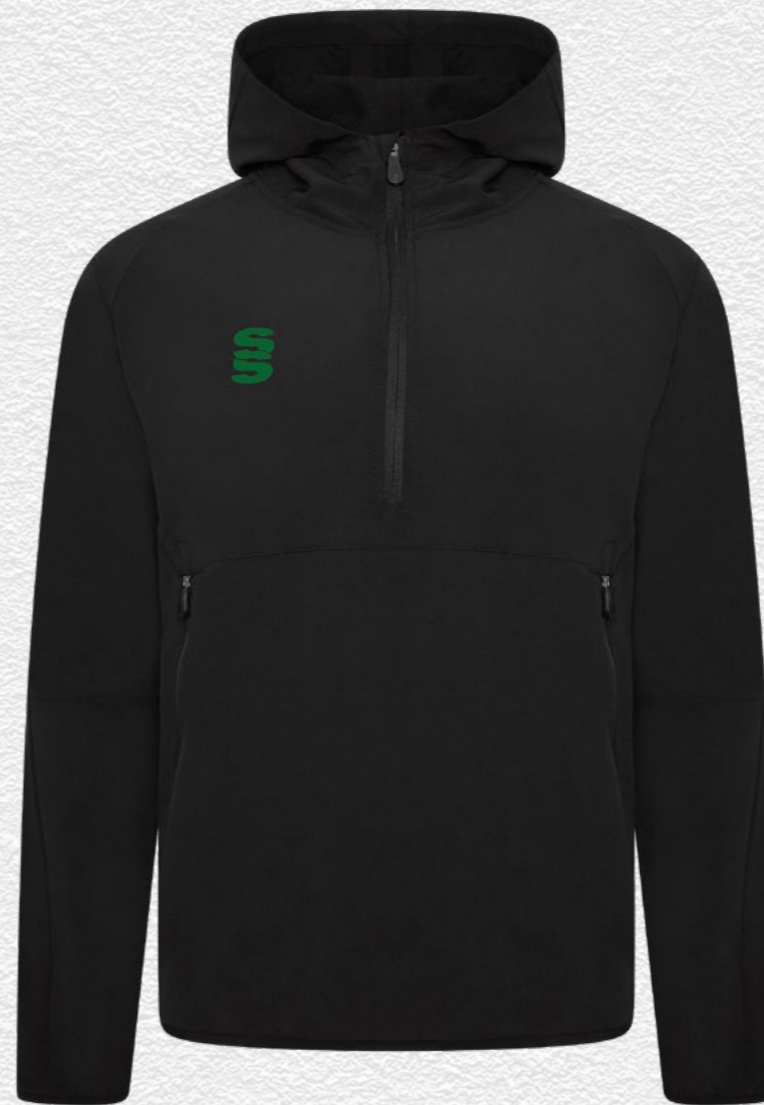
Holkham Down Feel Jacket SUR181