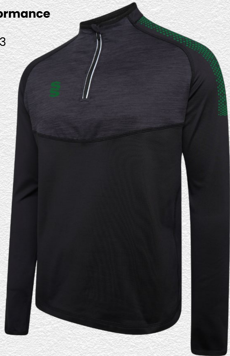
Dual Performance Top DU013