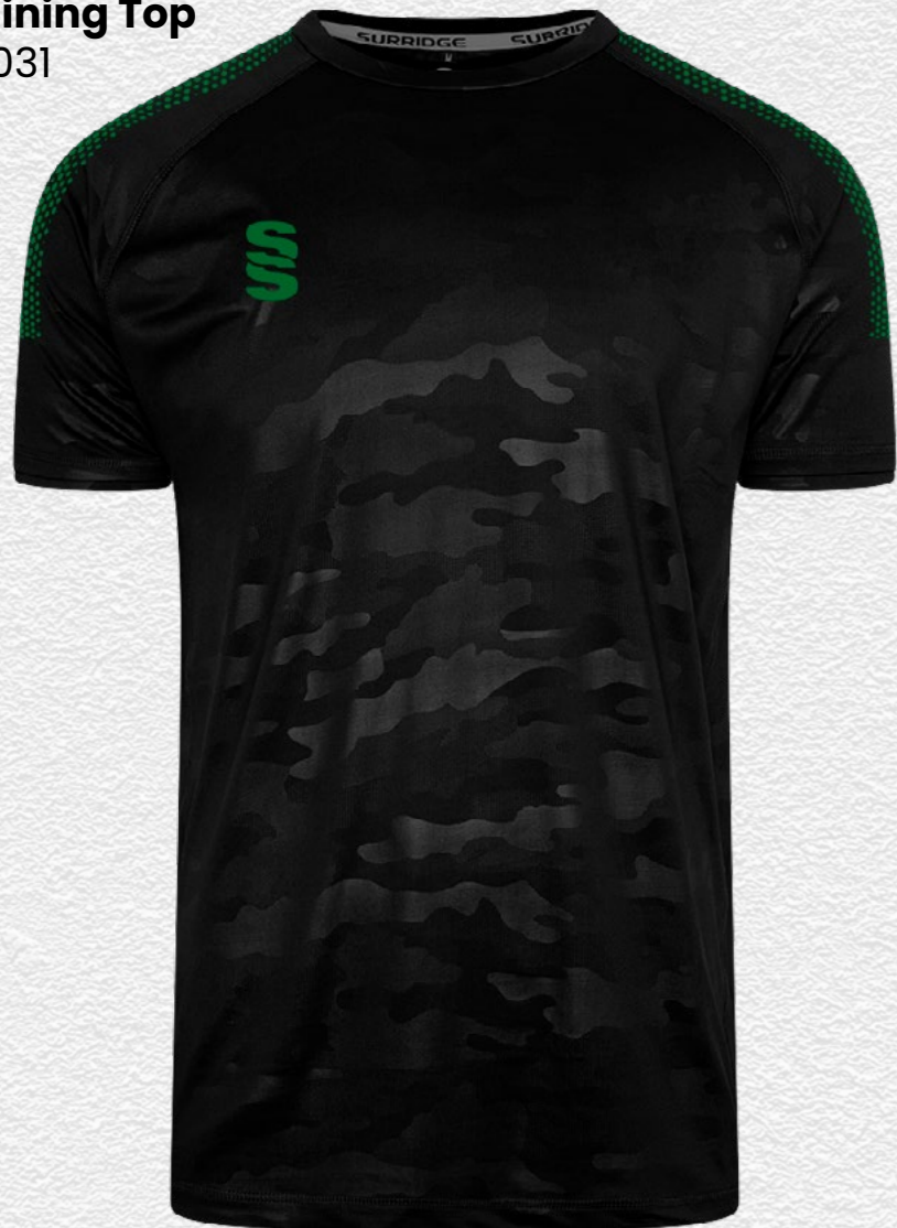
Camo Training Top DU031