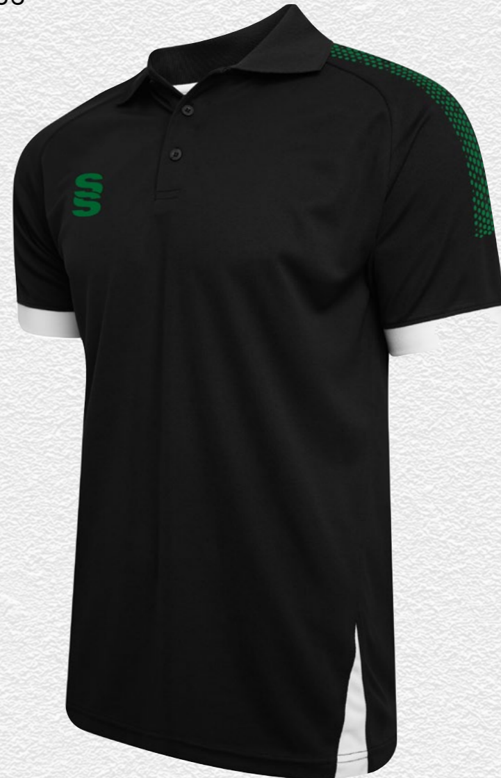
Fuse Polo Shirt DU366