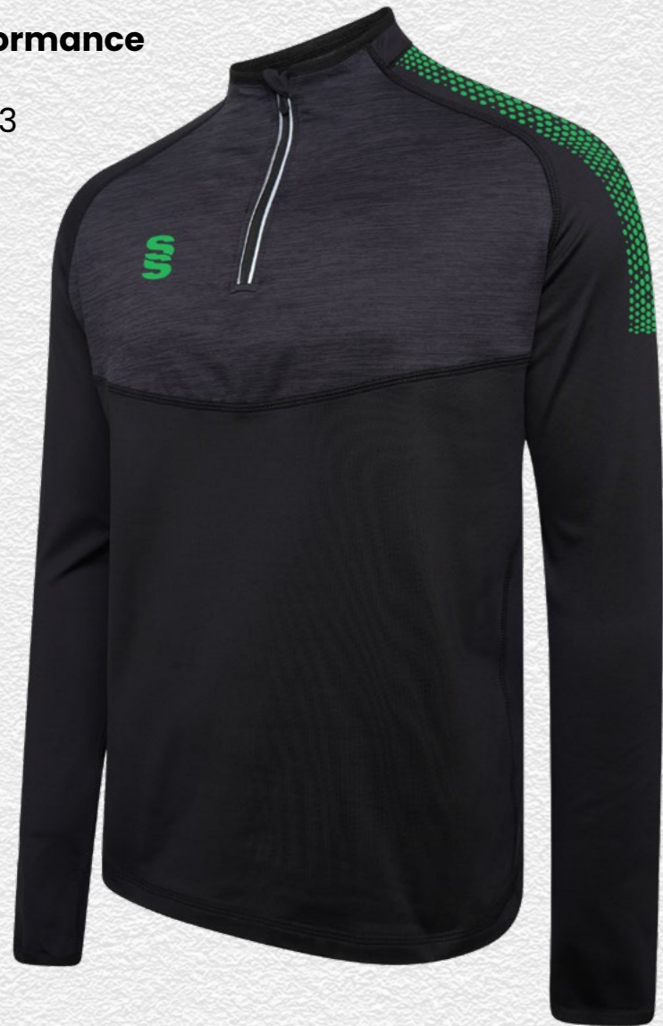
Dual Performance Top DU013