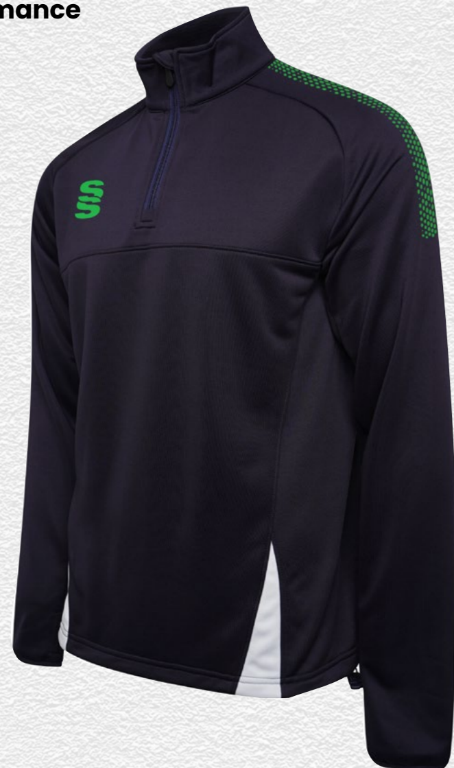
Fuse 1/4 Zip Performance Top DU368