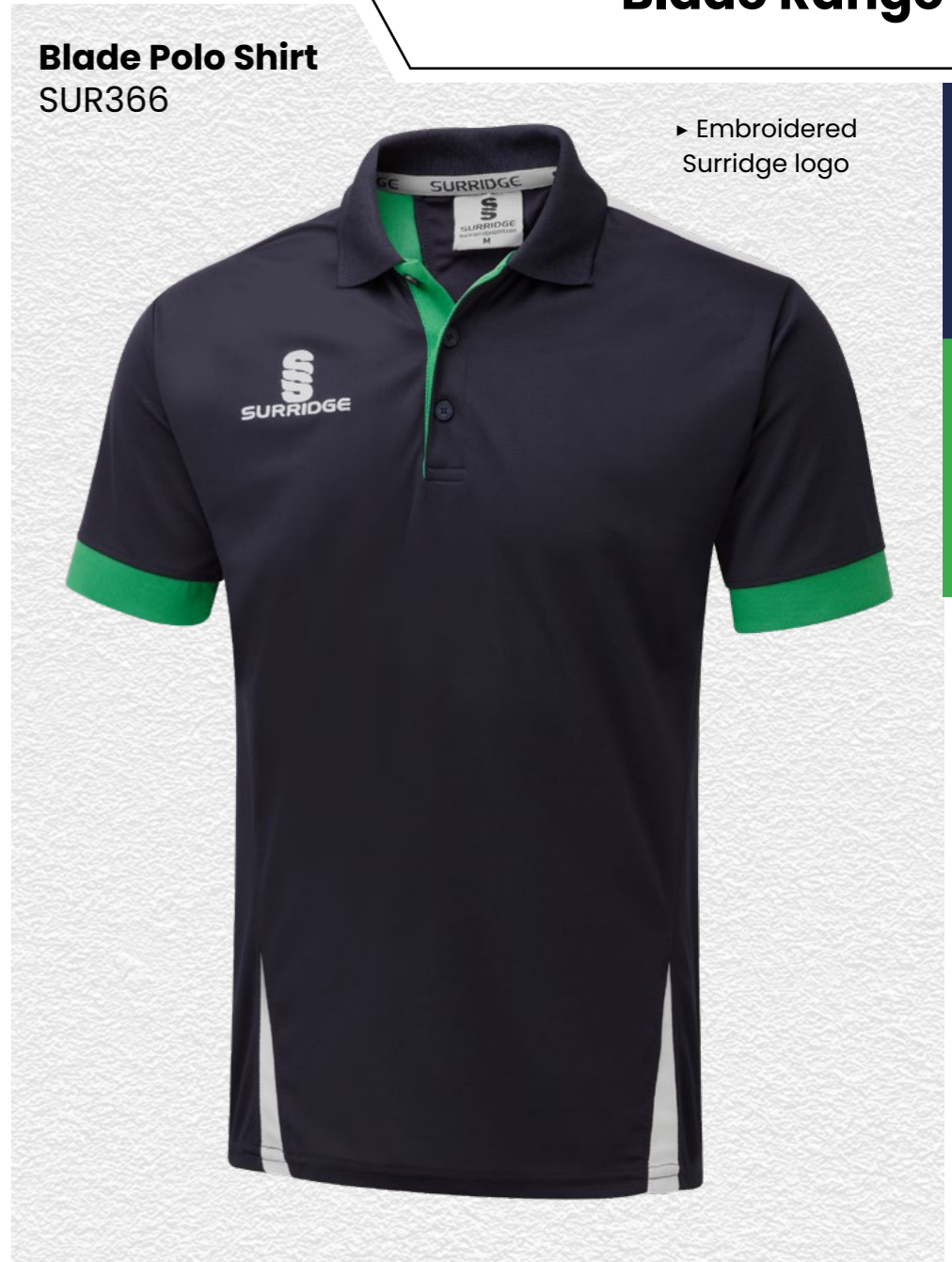
Blade Polo Shirt SUR366