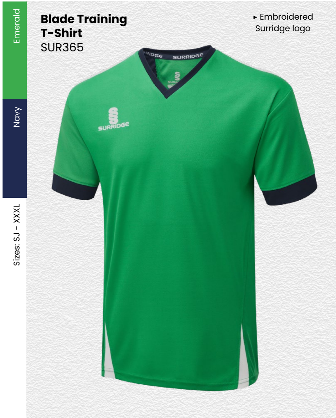
Blade Training T-Shirt SUR365