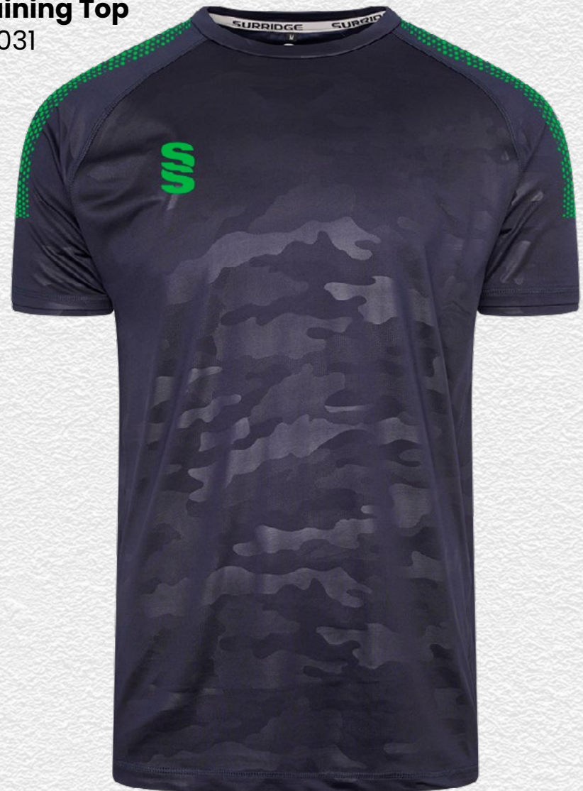
Camo Training Top DU031