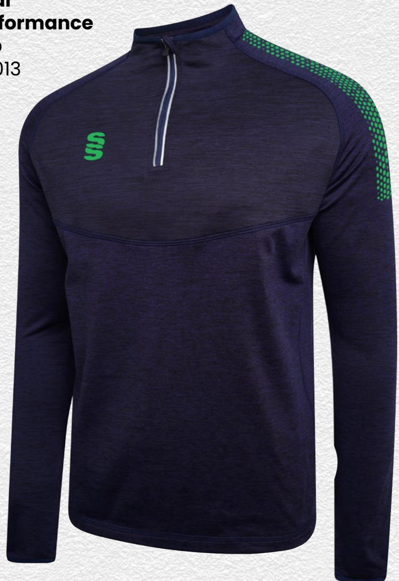
Dual Performance Top DU013