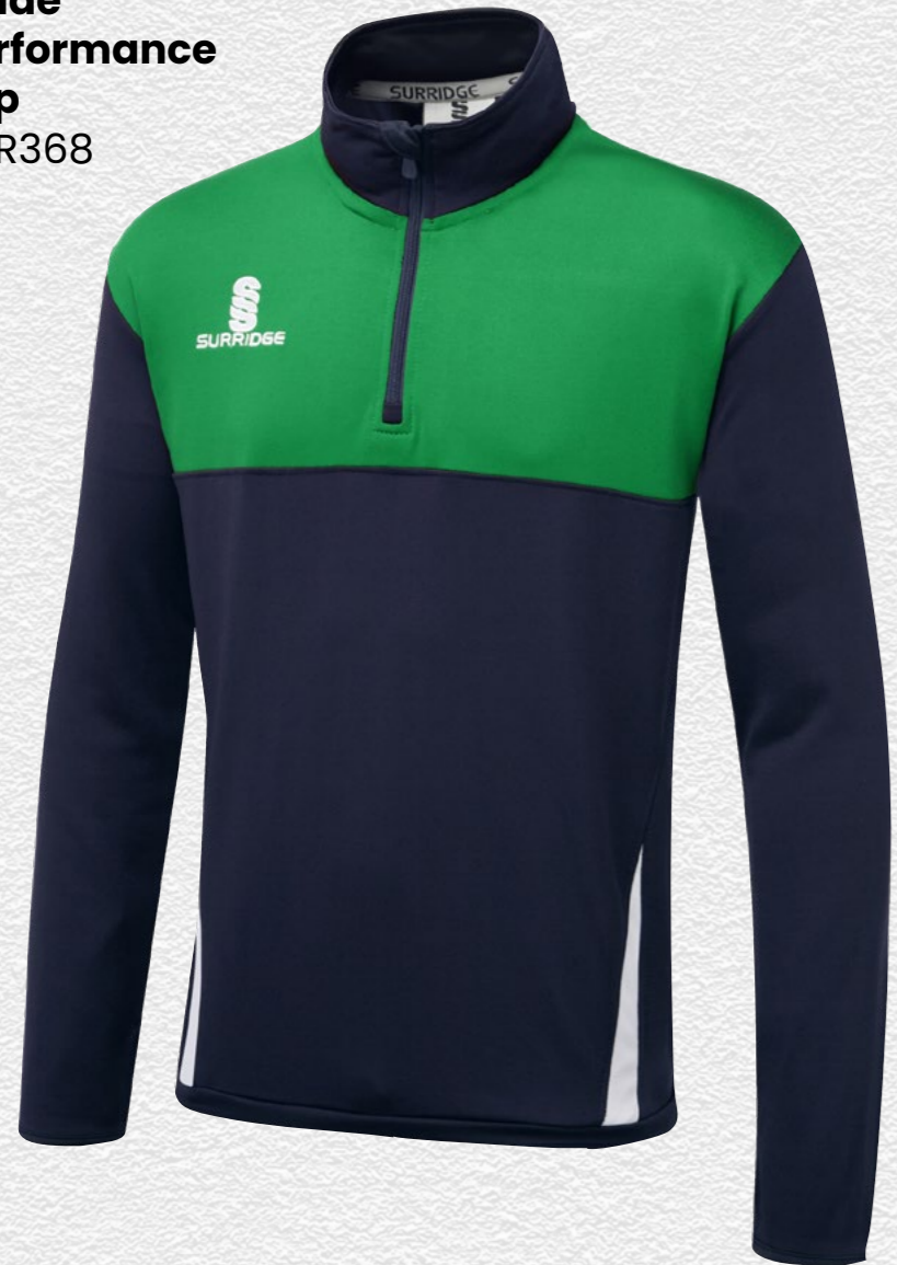
Blade Performance Top SUR368