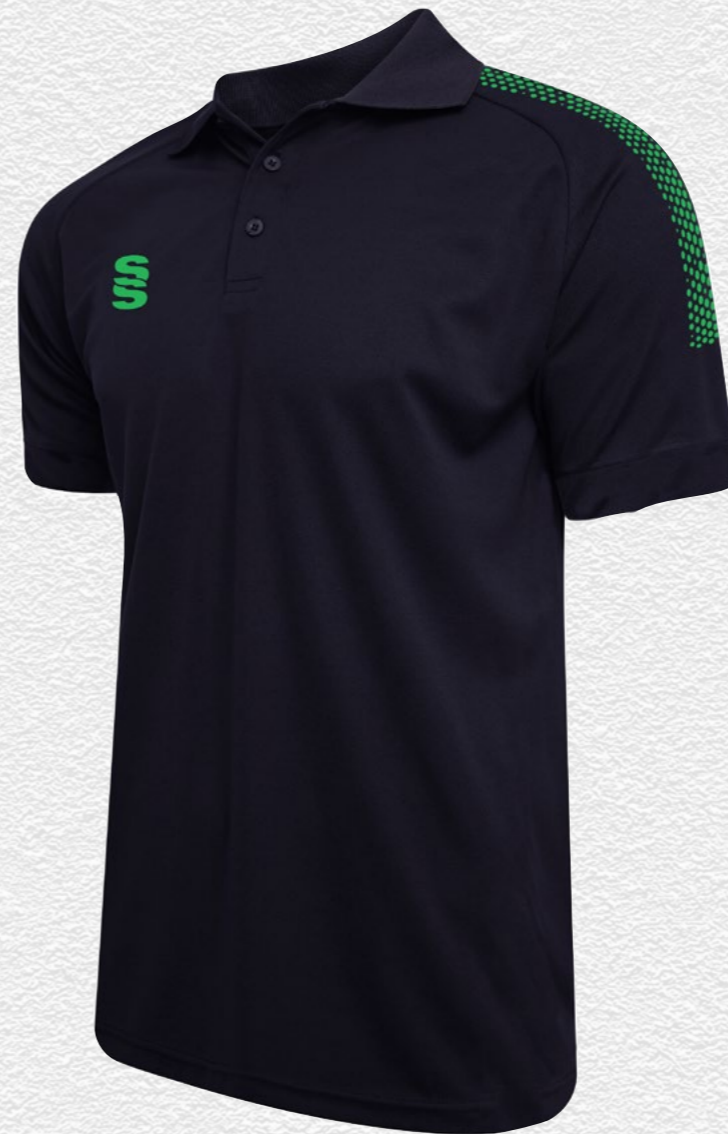
Dual Gym Shirt DU014