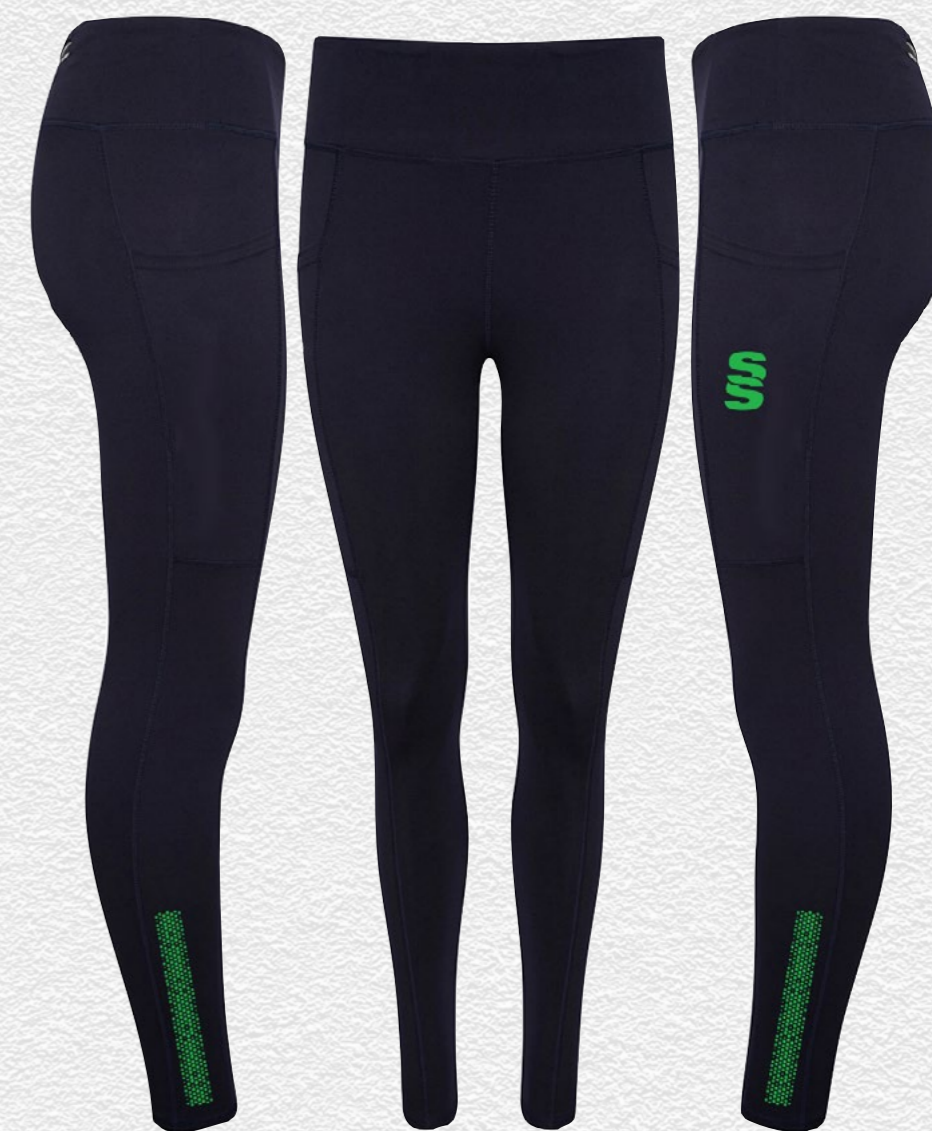
Performance Legging DU028