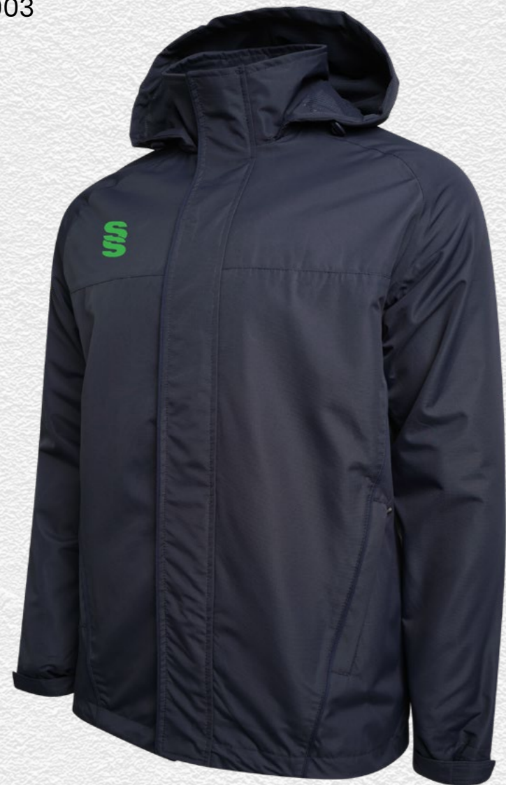
Dual Rain Jacket DU003