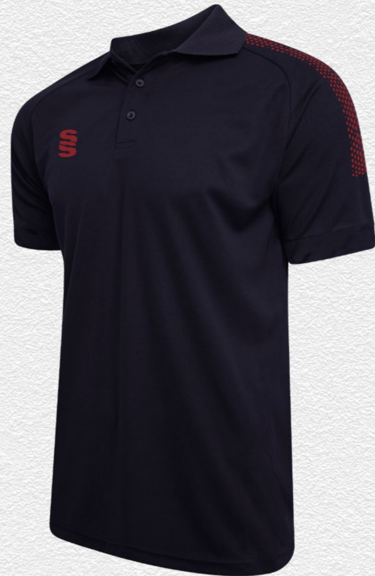
Dual Gym Shirt DU014