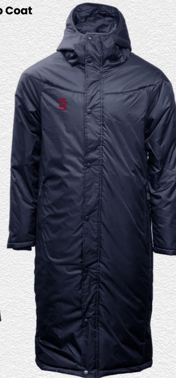
Pro Windbreaker BEHR003