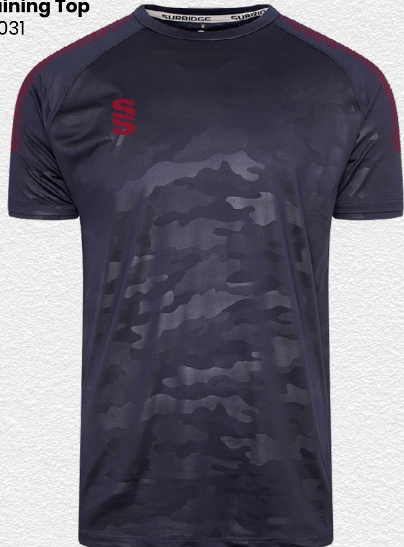
Camo Training Top DU031