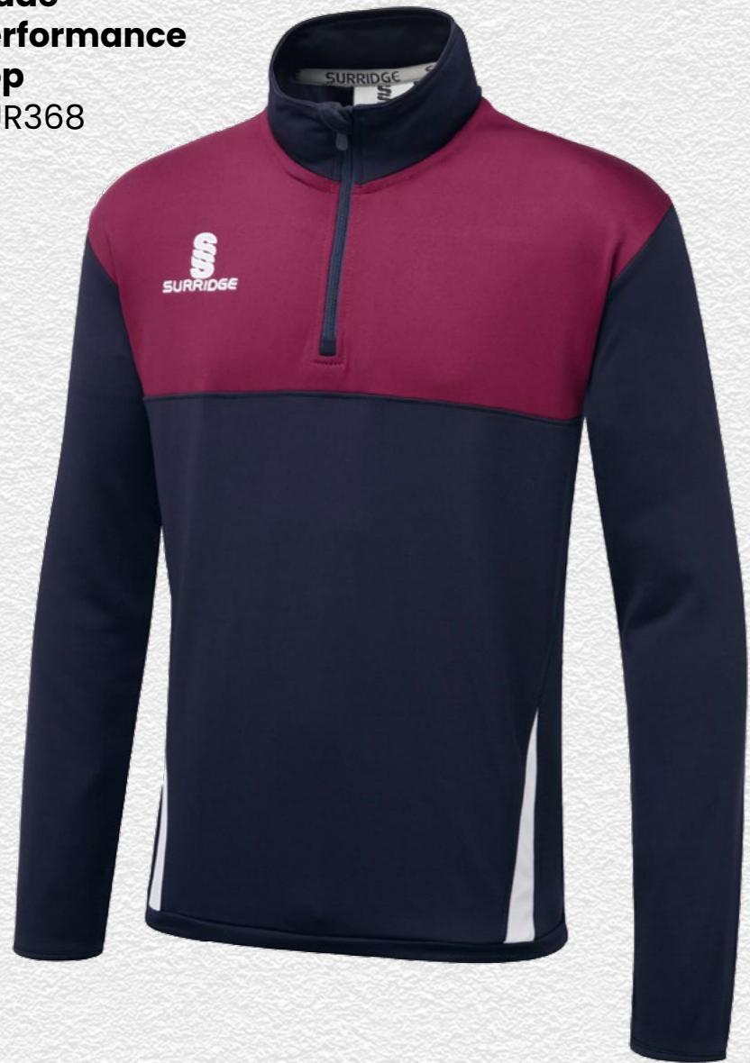
Blade Performance Top SUR368