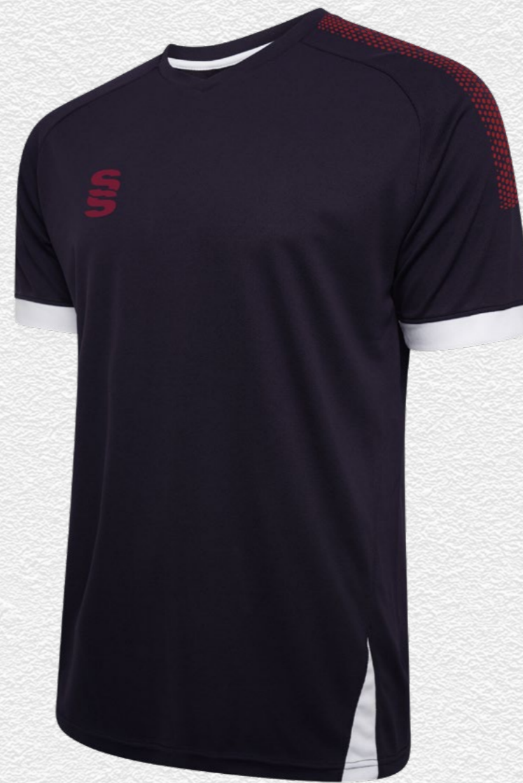
Fuse T-Shirt DU365