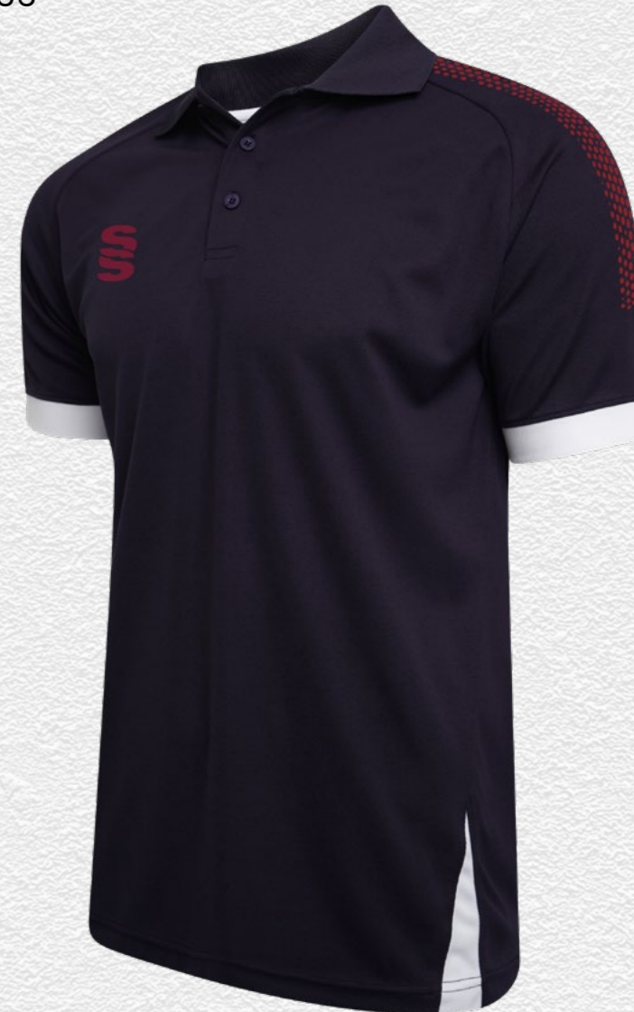
Fuse Polo Shirt DU366