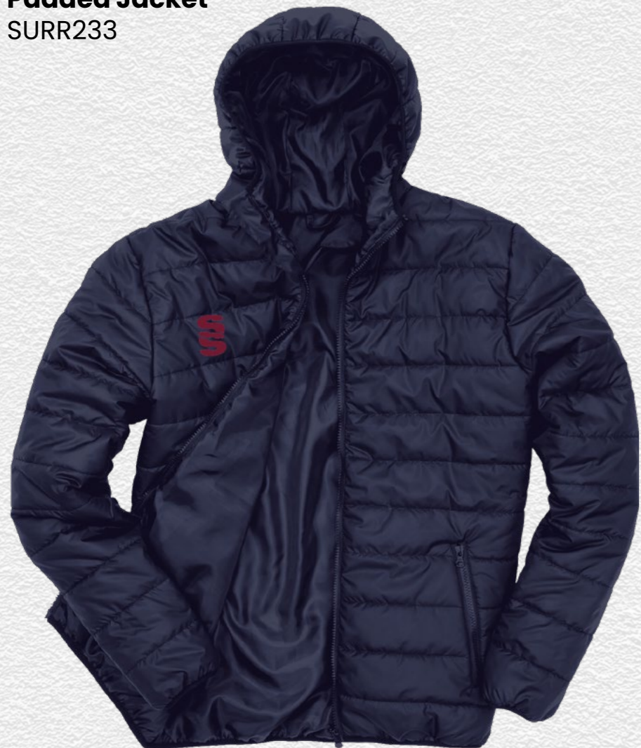
Supersoft Padded Jacket SURR233