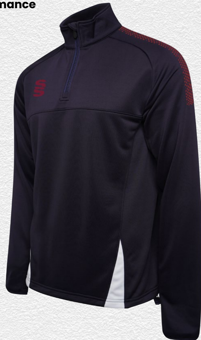
Fuse 1/4 Zip Performance Top DU368