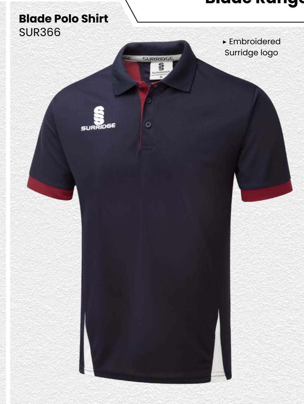
Blade Polo Shirt SUR366