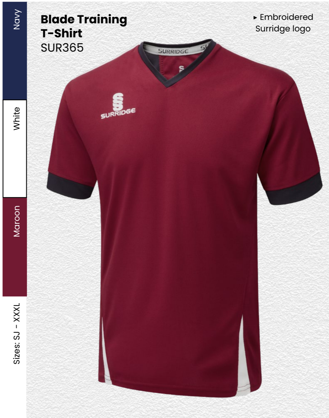
Blade Training T-Shirt SUR365