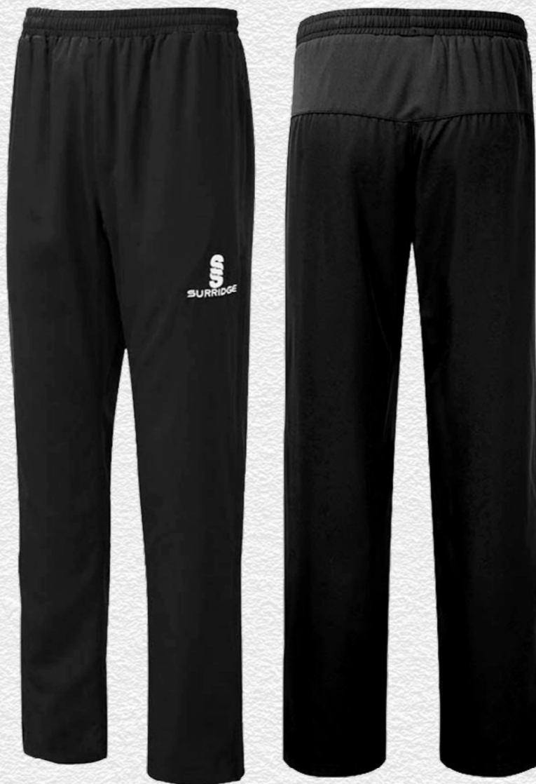
Performance Legging DU028