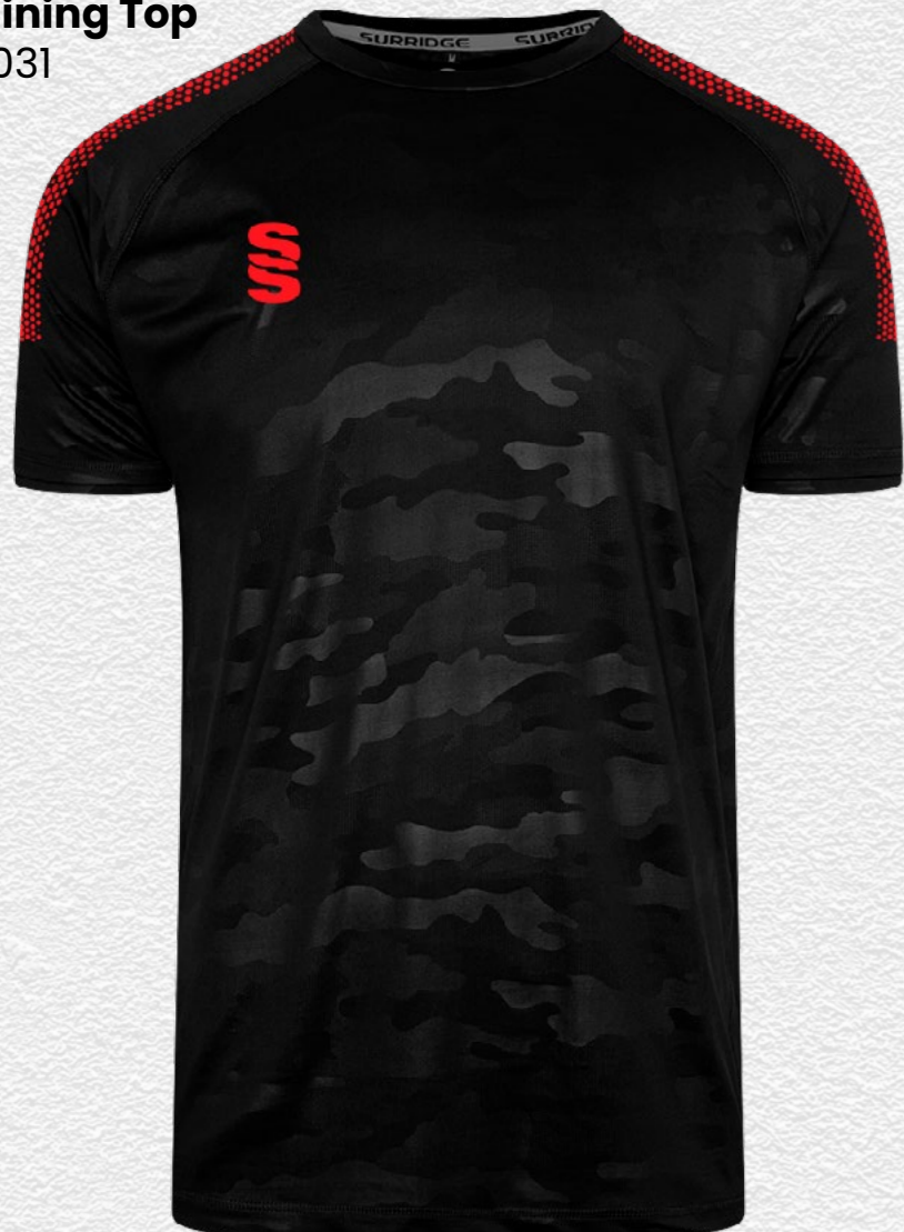
Camo Training Top DU031