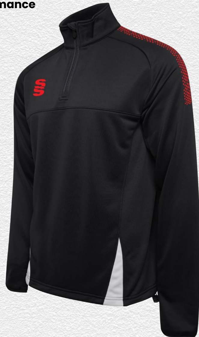
Fuse 1/4 Zip Performance Top DU368