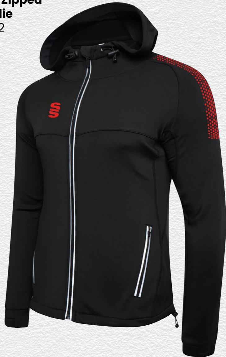
Dual Zipped Hoodie DU012