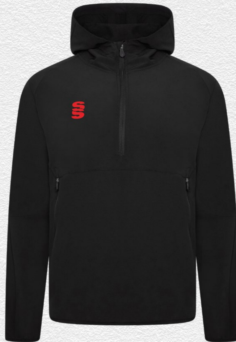
Holkham Down Feel Jacket SUR181