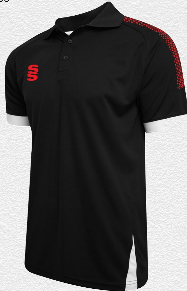
Fuse Polo Shirt DU366