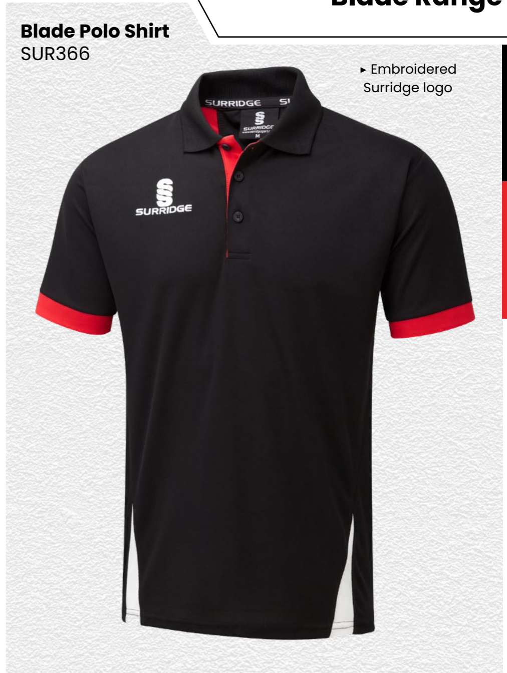
Blade Polo Shirt SUR366