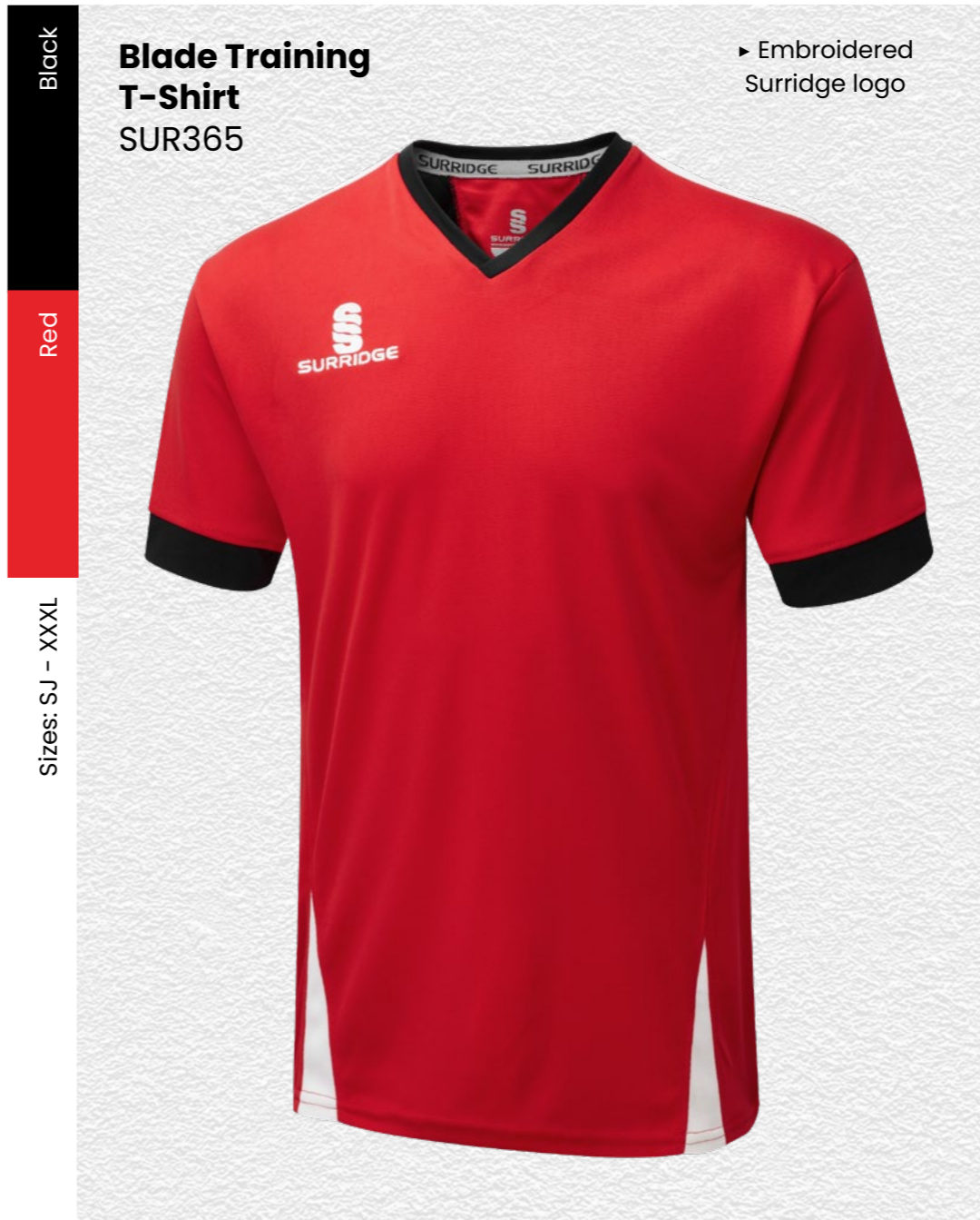
Blade Training T-Shirt SUR365