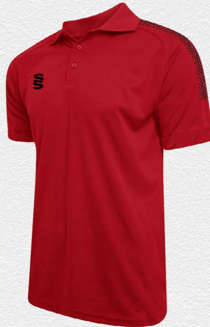
Dual Gym Shirt DU014