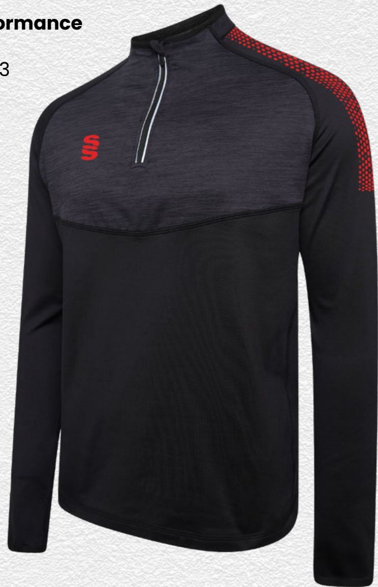
Dual Performance Top DU013