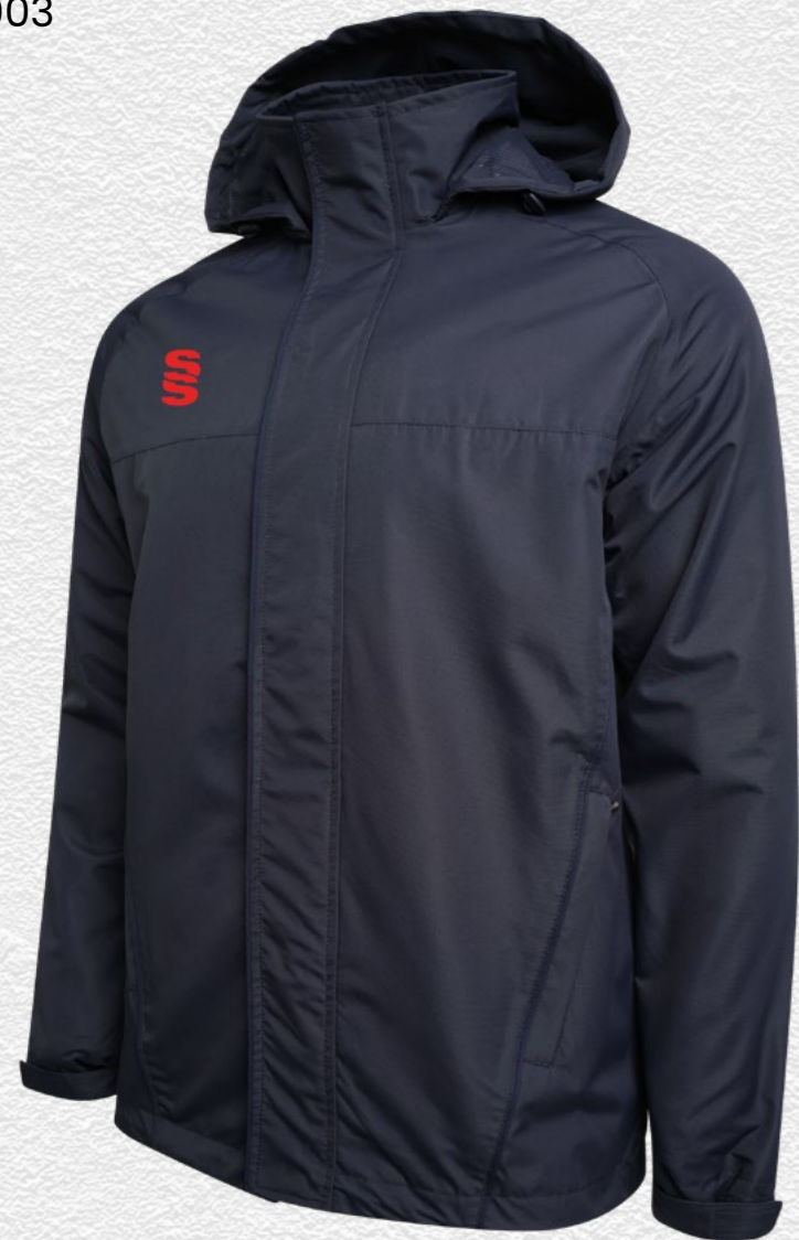
Dual Rain Jacket DU003