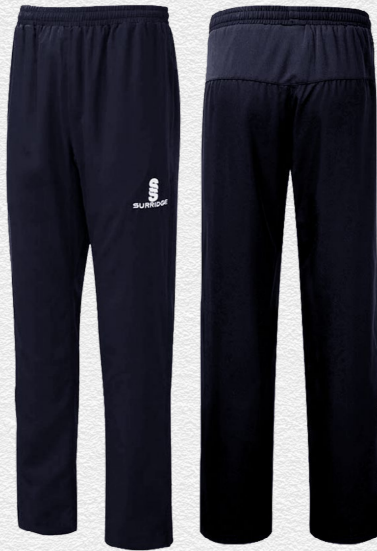
Performance Legging DU028