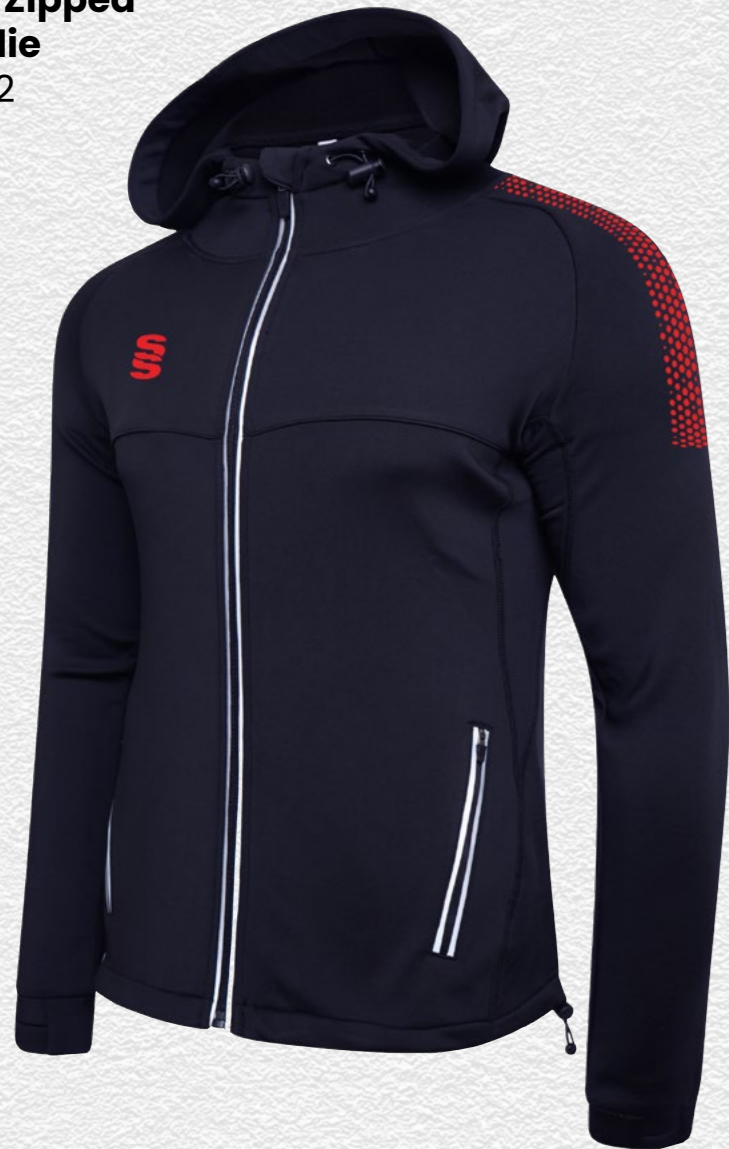
Dual Zipped Hoodie DU012