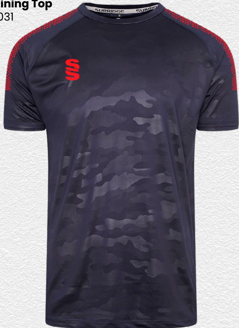
Camo Training Top DU031