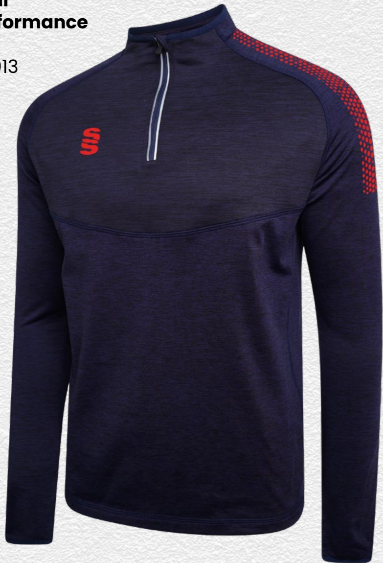
Dual Performance Top DU013