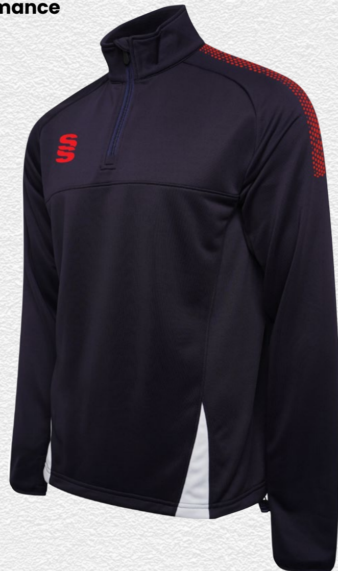
Fuse 1/4 Zip Performance Top DU368