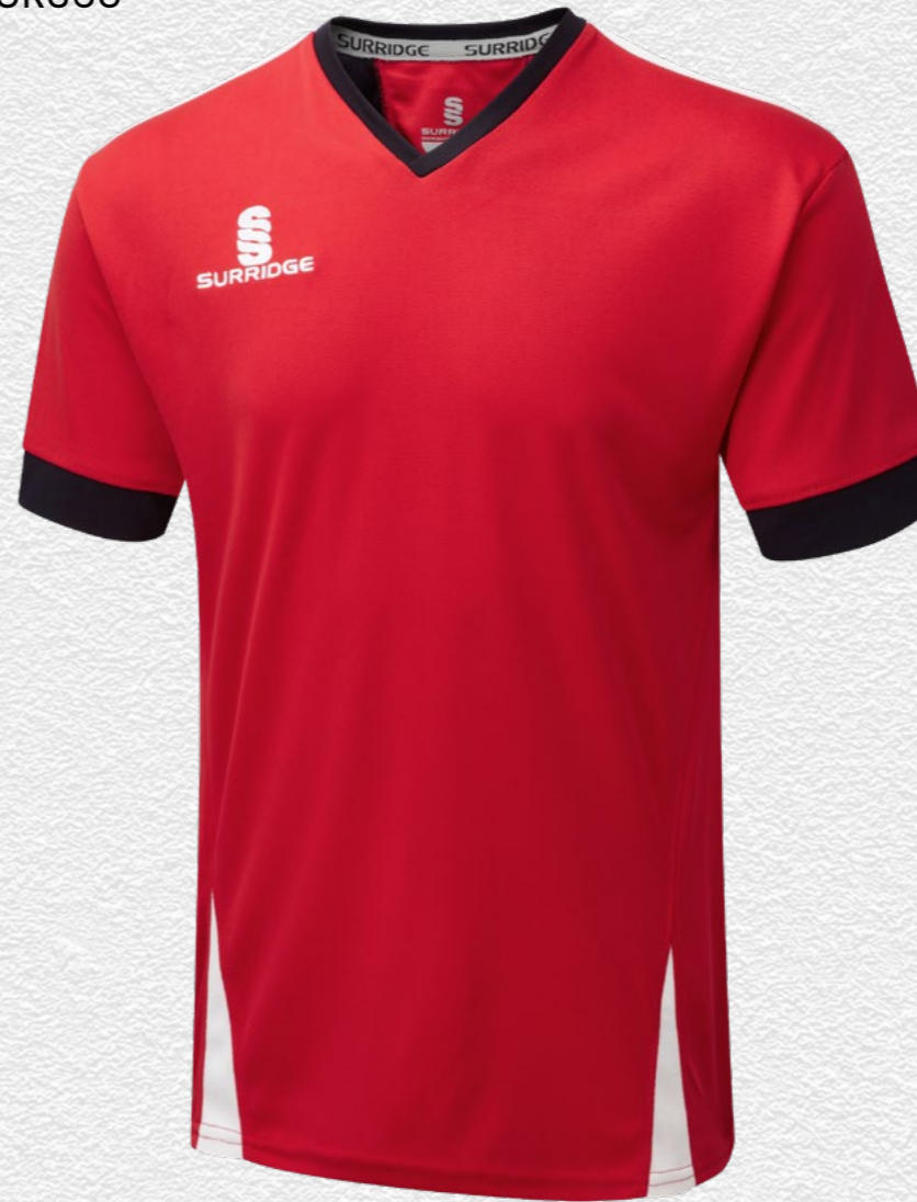
Blade Polo Shirt SUR366