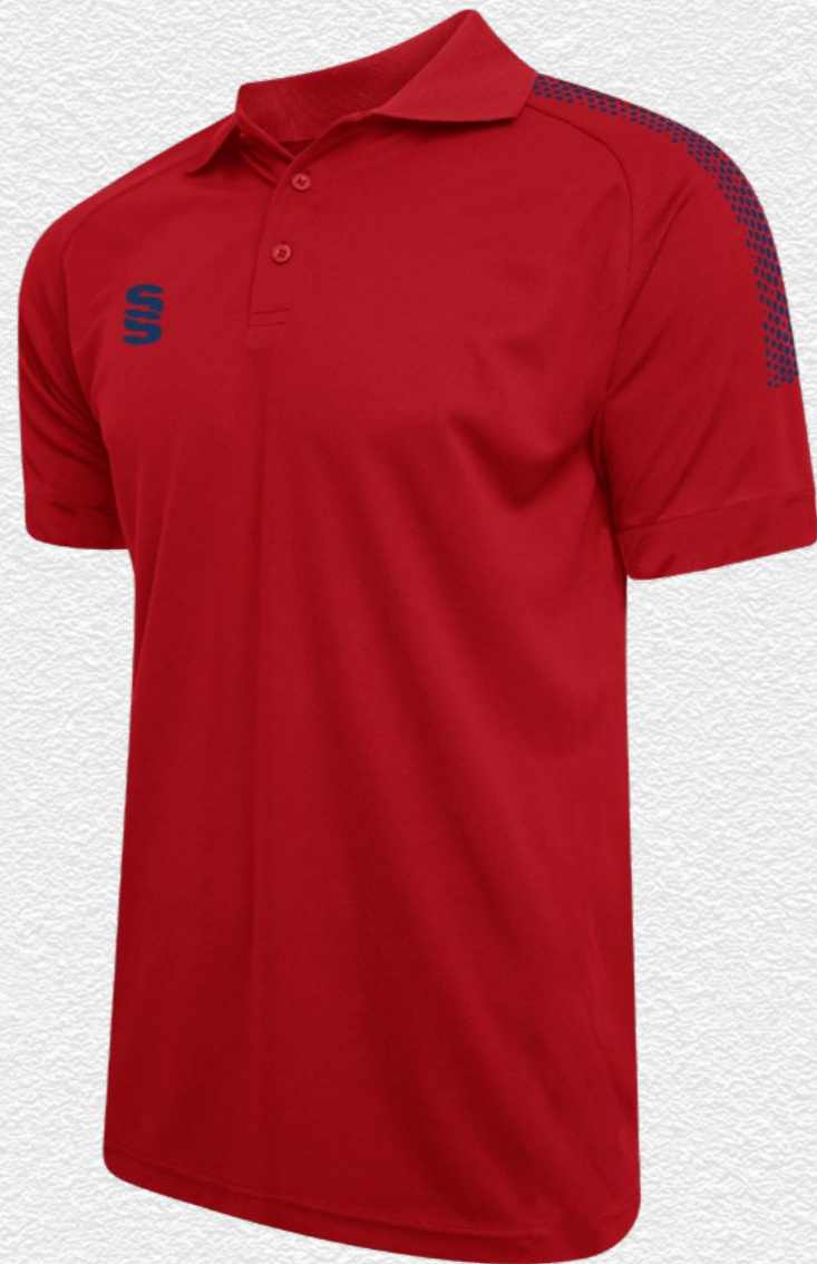
Dual Gym Shirt DU014