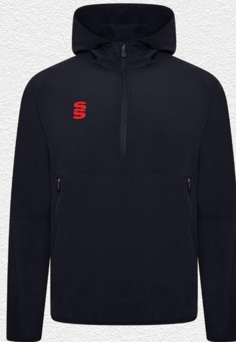
Holkham Down Feel Jacket SUR181