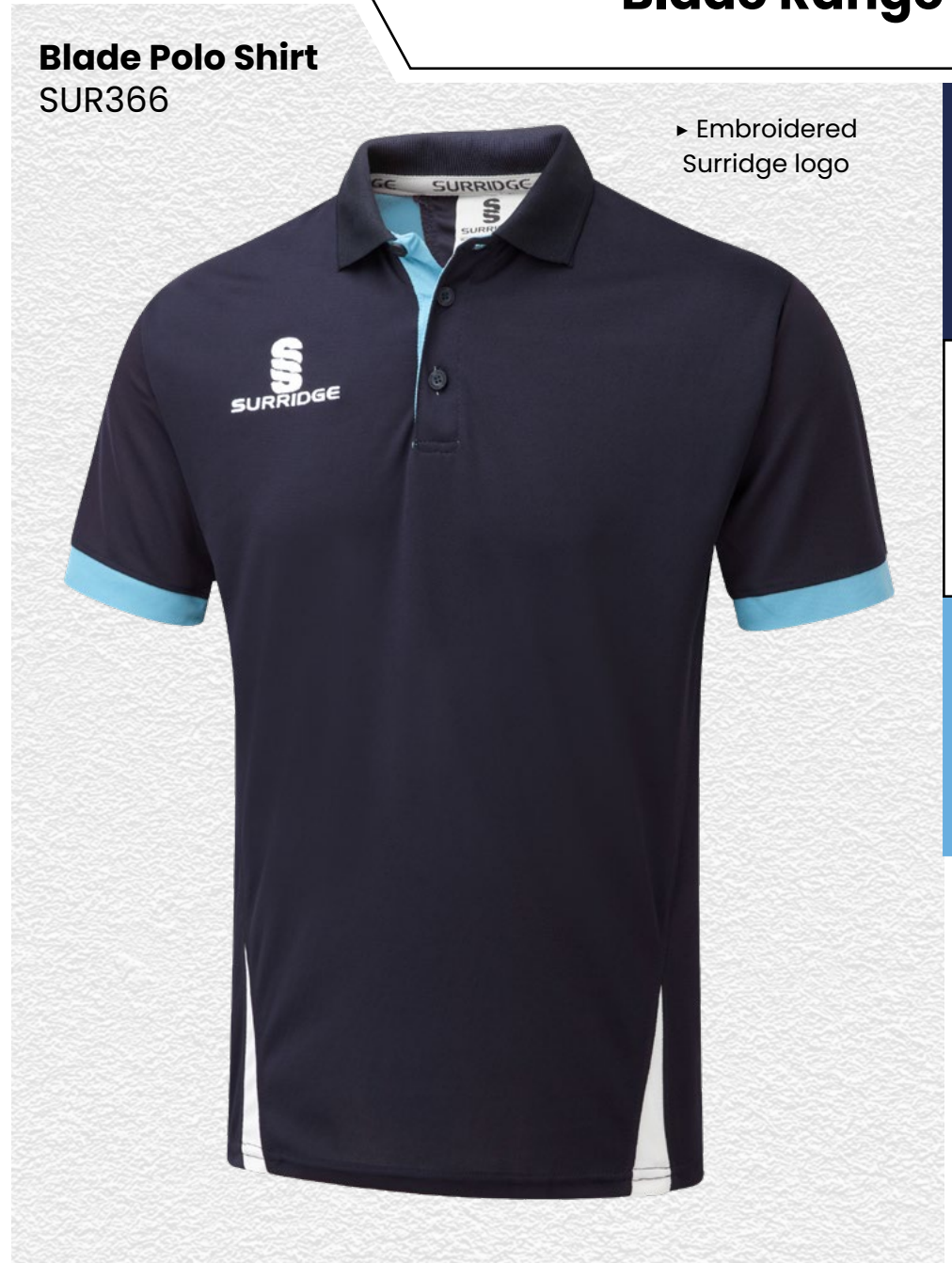
Blade Polo Shirt SUR366