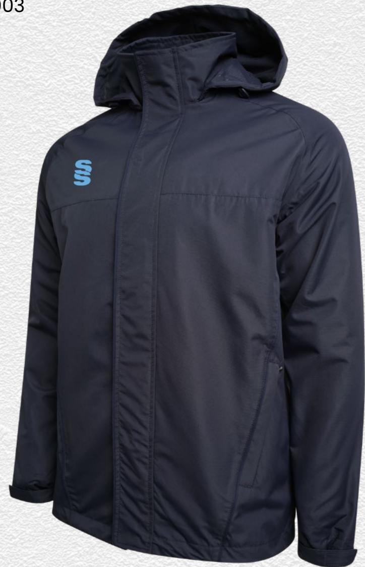
Dual Rain Jacket DU003