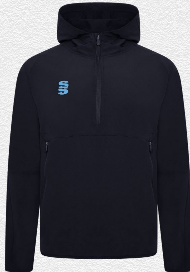
Holkham Down Feel Jacket SUR181