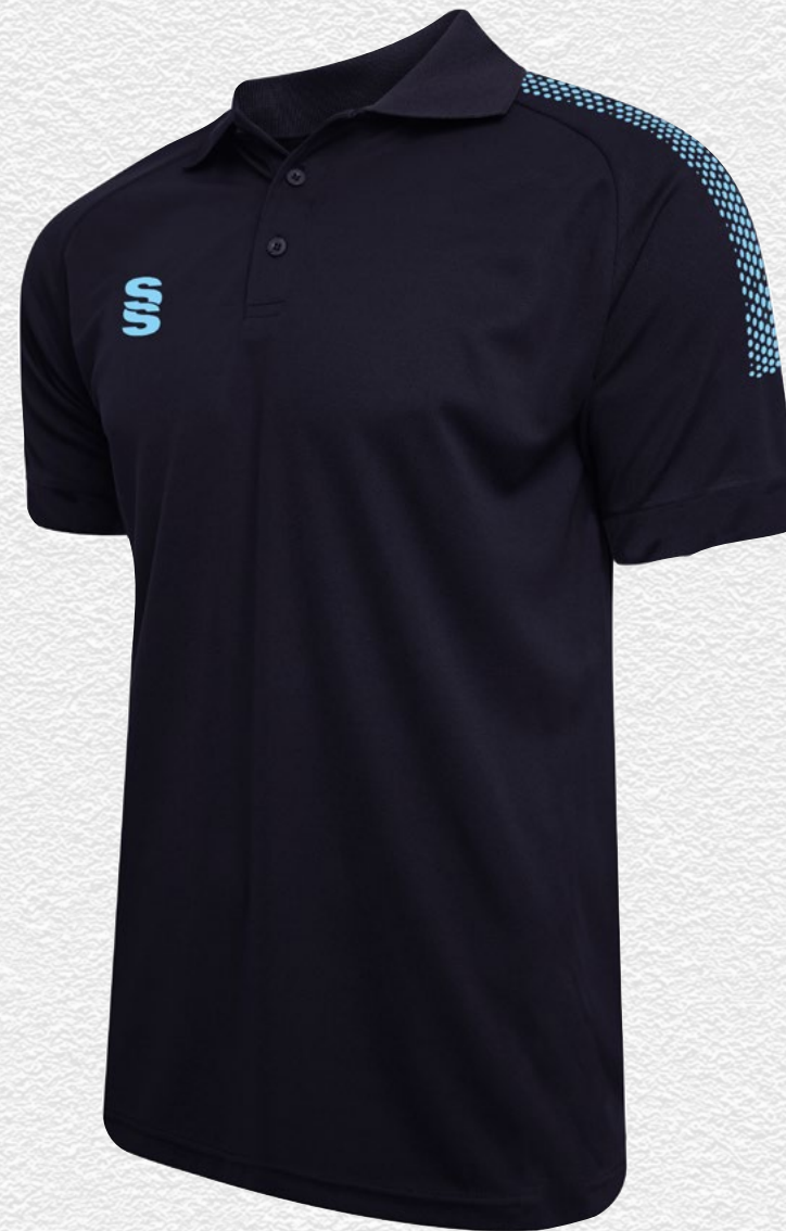
Dual Gym Shirt DU014