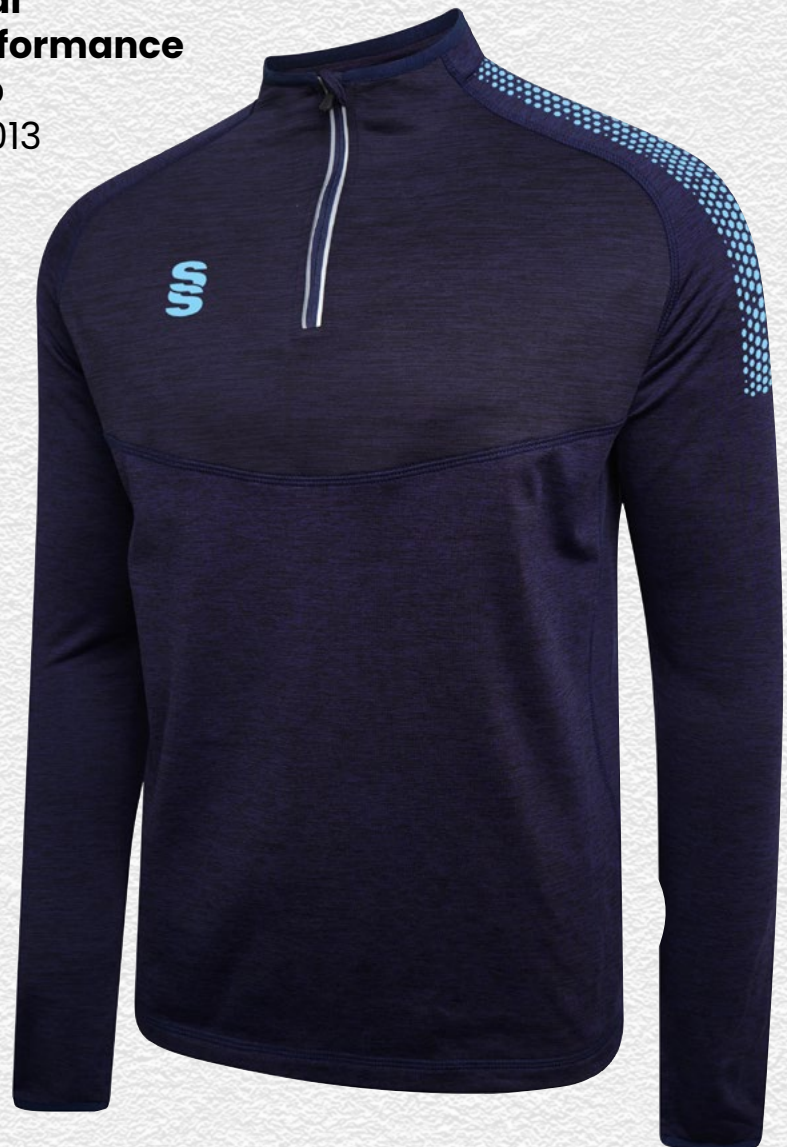
Dual Performance Top DU013