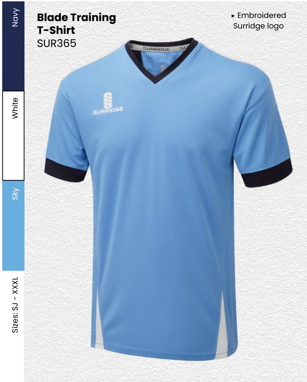
Blade Training T-Shirt SUR365