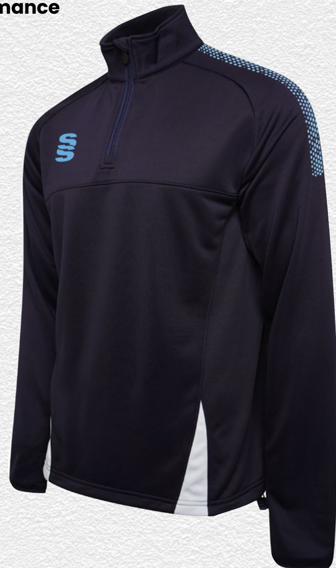
Fuse 1/4 Zip Performance Top DU368