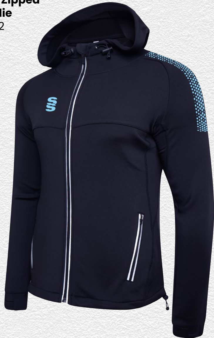
Dual Zipped Hoodie DU012