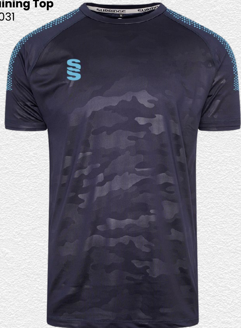
Camo Training Top DU031