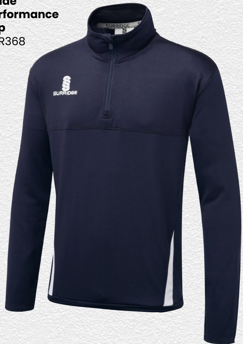
Blade Performance Top SUR368