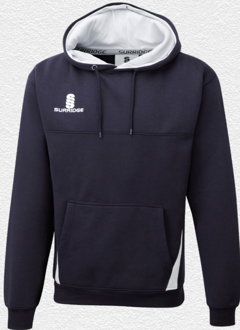
Blade Hoody SUR367