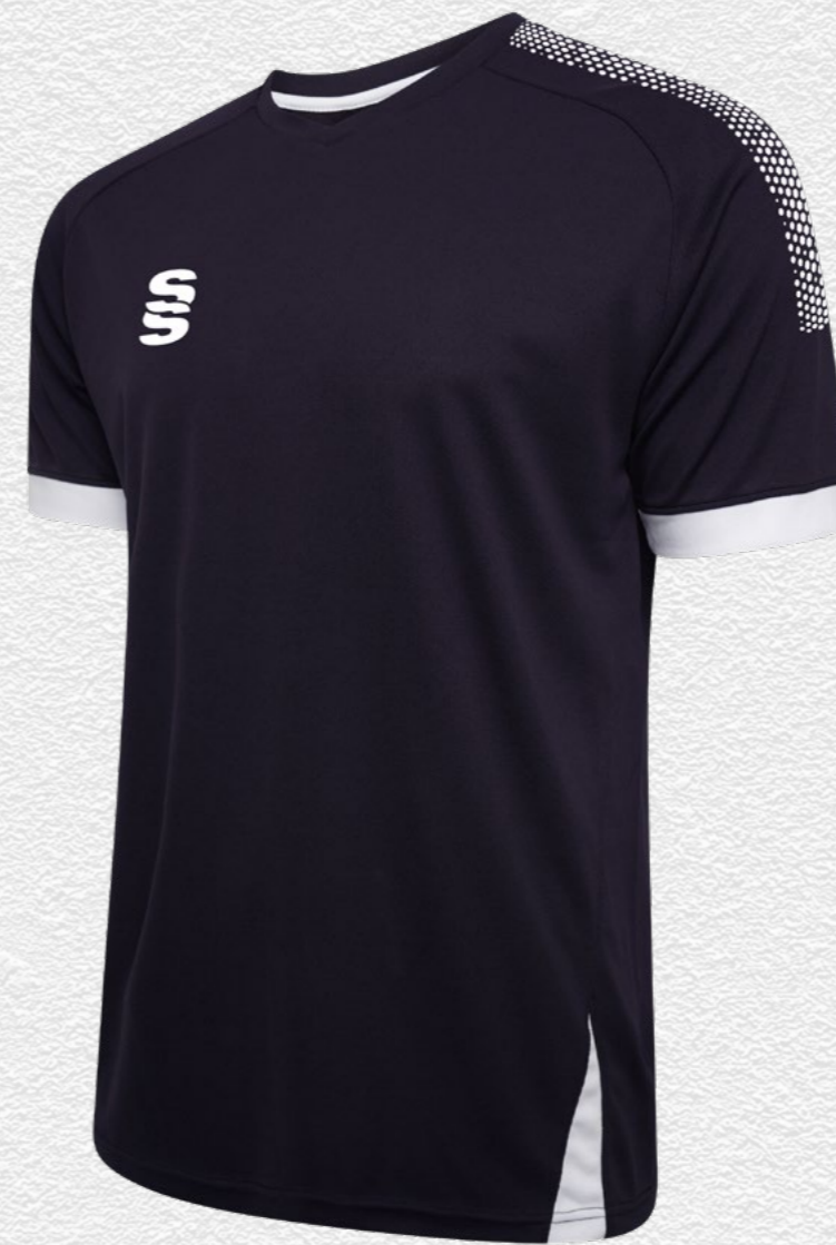
Fuse T-Shirt DU365