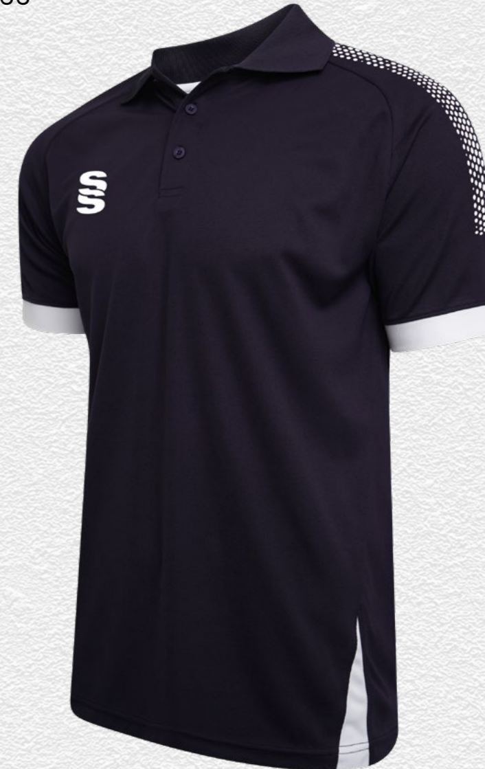
Fuse Polo Shirt DU366