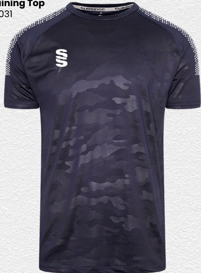
Camo Training Top DU031