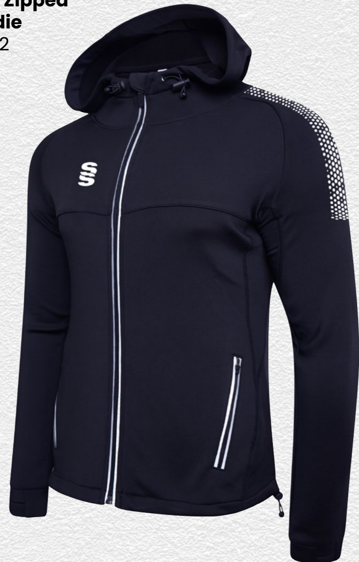
Dual Rain Jacket DU003