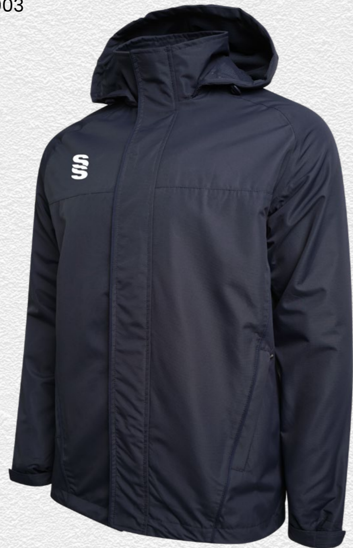
Dual Rain Jacket DU003