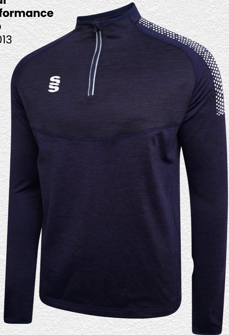
Dual Performance Top DU013