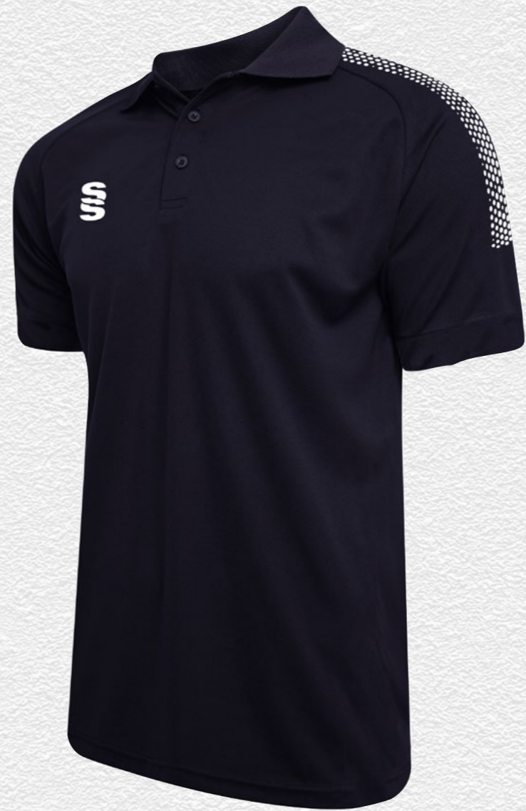
Dual Gym Shirt DU014