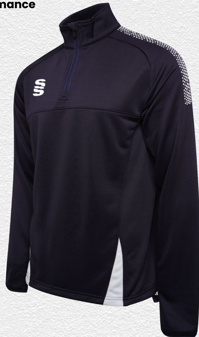
Fuse 1/4 Zip Performance Top DU368